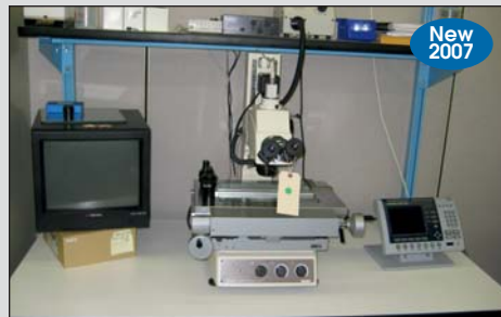
Nikon Microscope W/ Quadra-Chek DRO