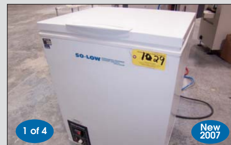
So-Low Environmental Freezer