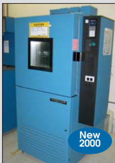
Thermotron #SM8 Environmental Test Chamber