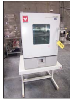
Yamato #DKN402 Constant Temperature Oven