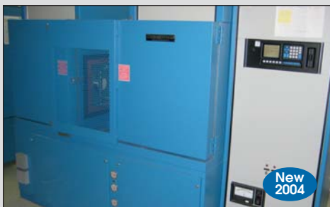
Thermotron # ATS-100-H3-3 Environmental Test Chamber