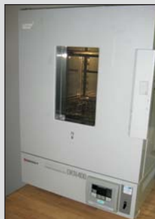
Yamato Electric Oven Model DKN 400