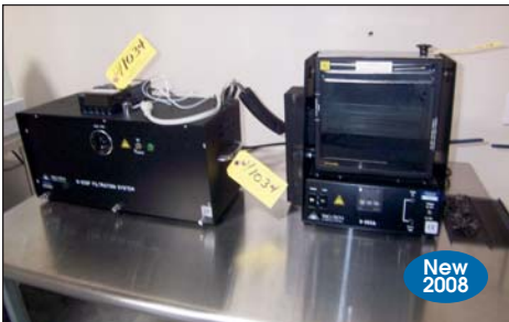
Trio-Tech # G-203A Bubble Tester Leak Detector