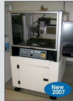
Asymtek Spectrum S-820 Precision Batch Dispenser