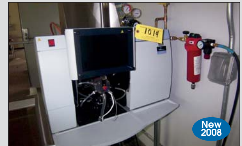
Perkin Elmer Aanalyst 400 Spectrometer