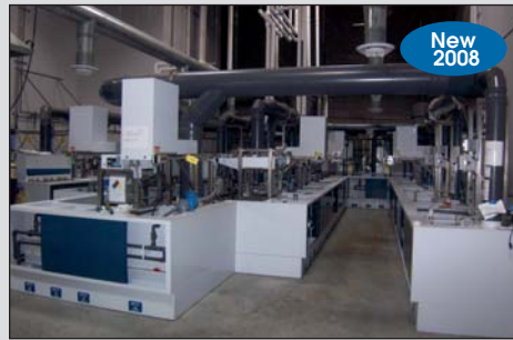
CJI Process Systems Plating Line w/ 68-Tanks