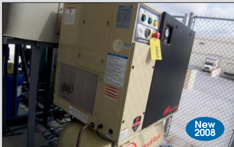
Ingersoll Rand 7.5 HP Rotary Screw Air Compressor