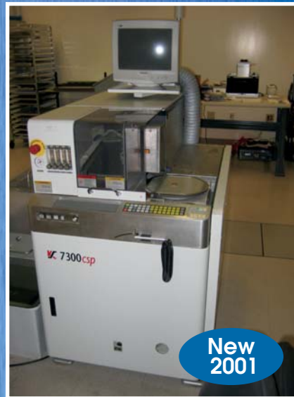
Kulicke & Soffa #7300- CSP Wafer Saw