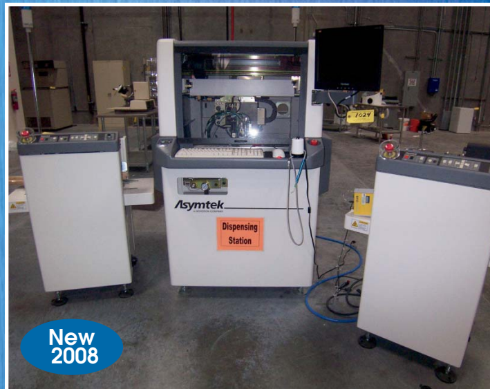
Asymtek Axiom X-1000 Precision Batch Dispenser