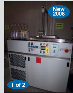
Branson Degreaser Model B452R