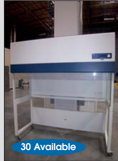
Esco Laminar Flow Cabinet Model Airstream