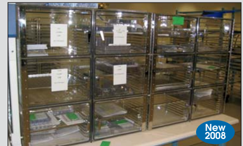
View of Desiccant Cabinets