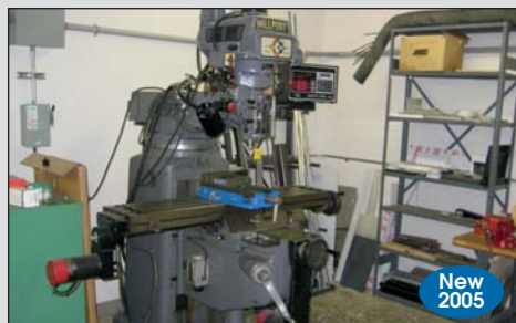
Millport #3KV Vertical Mill W/ Proto-Trak Control