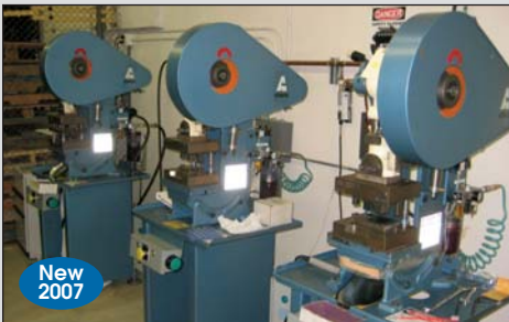
(3) Azimuth 6 Ton OBI Bench Presses