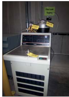
Varian Leak Tester Model Turbo Auto-Test 947