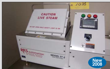
Robotic Process Systems #ST-2 Steam Aging System