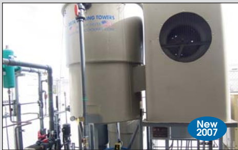
Delta #T30 Cooling Towers, Self Contained