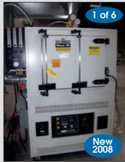
Blue M #LGF- 7780-F- MP550 Inert Gas Oven