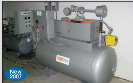
Busch Vacuum Pump