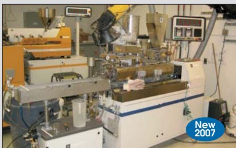
Dr Collin #ZK25XX42N Twin Screw Extruder

QUANTUM LEAP PACKAGING, INC. DESIGNS AND MANUFACTURES HERMETIC AND NEAR-HERMETIC AIR CAVITY PACKAGES FOR SEMICONDUCTOR ASSEMBLY. IT OFFERS AIR CAVITY QFNs, SOICs, AND LIQUID CRYSTAL ON SILICON PACKAGES, AS WELL AS CONNECTOR-IN-PACKAGES. THE COMPANY'S PRODUCTS ARE DESIGNED FOR A VARIETY OF APPLICATIONS, INCLUDING OPTICAL ELECTRONICS SYSTEMS, IMAGE SENSORS, HB-LEDS, MEMS, -FOR MORE INFO VISIT WWW.QLPKG.COM