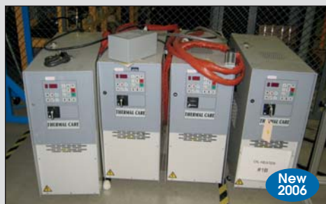
Thermal Care Model 65999-06-4 Mold Temp Controllers