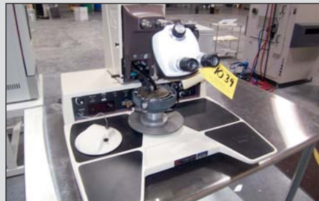
Kulicke & Soffa 4123 Stereo Zoom 4 Microscope