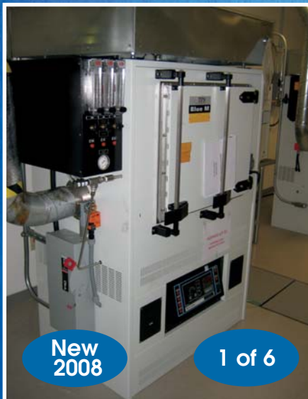
Blue M (TPS) #IGF-7780- G-MP550 Electric Oven