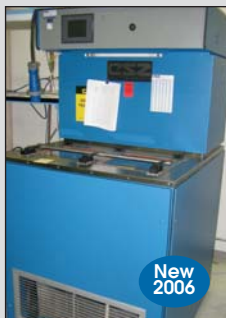
Cincinnati Sub-Zero #TSB-2P-1.5-1.5-S/A/C Thermal Shock Tester