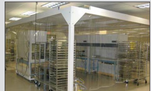
Clean Air Products Portable Clean Room