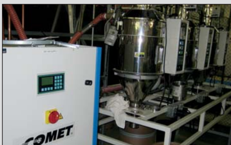
Comet V100 Volumetric Resin Feeders