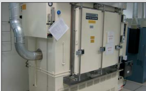
Blue M (TPS) #AGC-170G-MP2X309 Inert Gas Oven