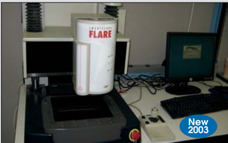
OGP Smartscope Flare Coordinate Measuring System