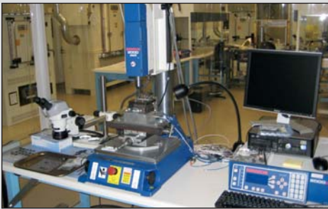
Branson 2000 Ultrasonic Welder