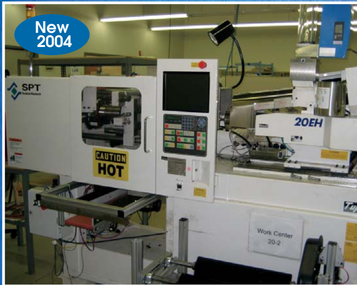
Sodick Plustech #TR20-EH Injection Molder

INSPECTION: MONDAY, MAY 11, 9 TO 4 PM (LOCAL)