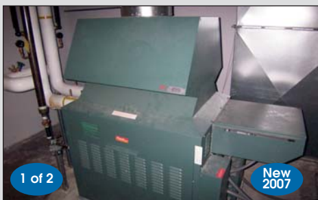
Raypak Hot Water Boiler