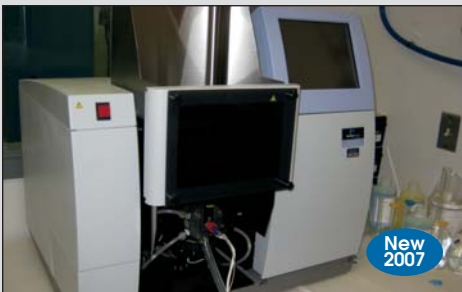
Perkin Elmer AANALYST 200 Spectrometer