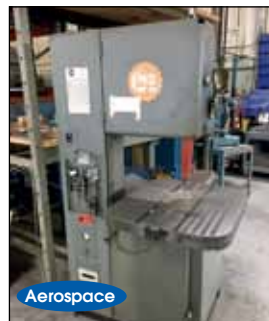
GROB # 4V-18 VERTICAL BAND SAW