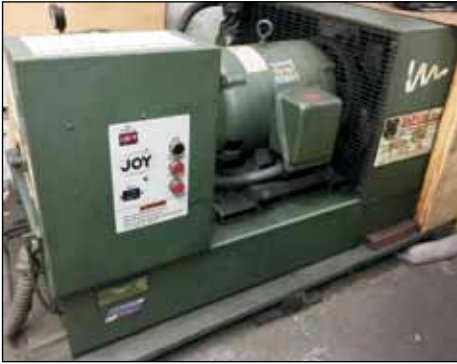
JOY "TWIST-AIR" 25 HP AIR COMPRESSOR