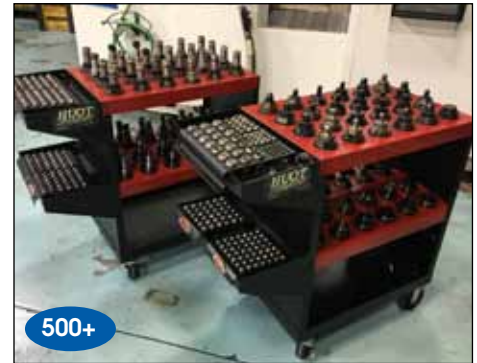
VIEW OF CNC TOOLHOLDERS