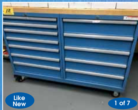
LISTA TOOL CABINET