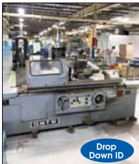
SMTW "UNIVERSAL" CYLINDRICAL GRINDER