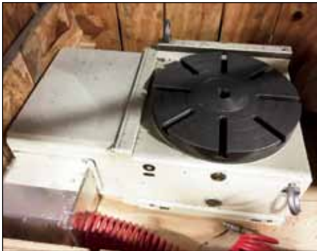
TSUDAKOMA # RN-300R "4TH-AXIS" ROTARY TABLE