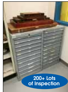
VIEW OF INSPECTION ITEMS