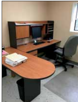
VIEW OF MODERN OFFICE SUITES