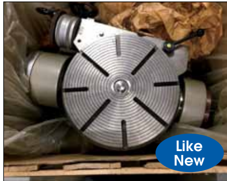
HOFFMANN 16" TILTING ROTARY TABLE