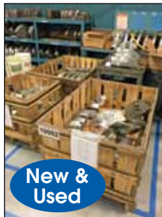
VIEW OF ALUMINUM PIE JAWS