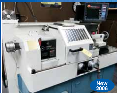
SWI-TRAK # TRL- 1630-SX CNC LATHE

Inspection: Tuesday, November 15 th , 9:00 - 3:00