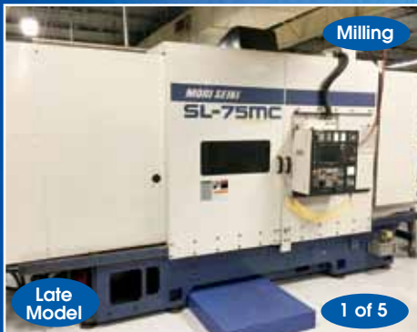
MORI-SEIKI # SL-75-MC CNC TURNING CENTER

Inspection: Monday, November 14 th , 9:00 - 5:00 (Bethel,CT. Only) (Other locations - By Appointment Only)