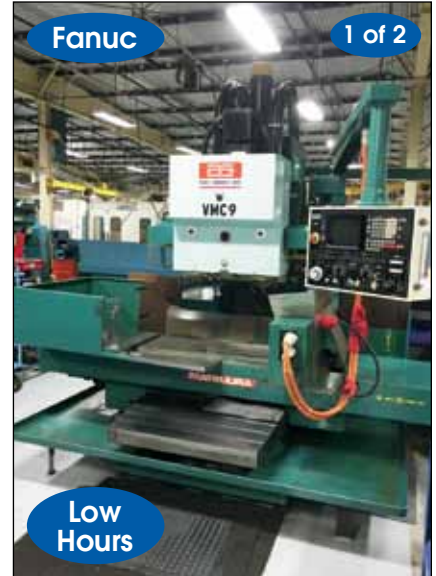
MATSUURA # MC-1000-VDC "TWIN SPINDLE" VMC