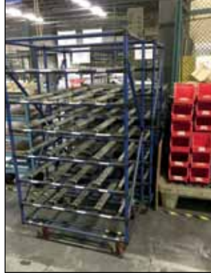
VIEW OF PARTS & W.I.P. CARTS