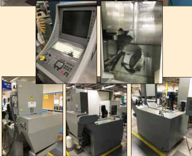
DECKEL-MAHO # DMU-50-EVOLUTION "5-AXIS" CNC VMC