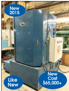
JRI "STAINLESS STEEL" 55" PARTS WASHING MACHINE