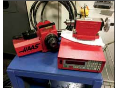
HAAS # HA-5C CNC INDEXER W/ CONTROL