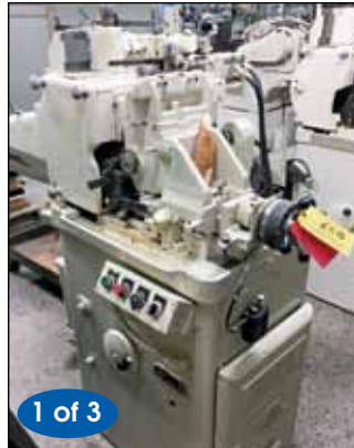
ROYALMASTER # TG-12 CENTERLESS GRINDER