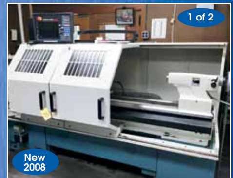
SWI-TRAK # TRL- 2460-SX CNC LATHE