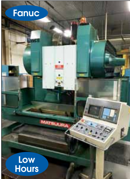
MATSUURA # MC-1000-VDC "TWIN SPINDLE" VMC