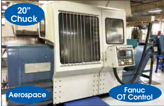
MORI-SEIKI # SL-7 CNC TURNING CENTER