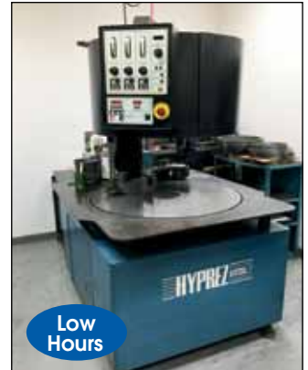
HYPREZ-ENGIS # LM-42 LAPPING MACHINE