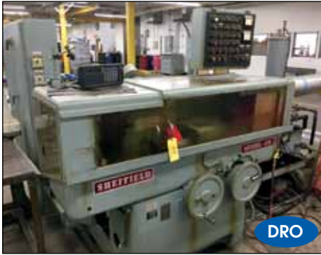
SHEFFIELD # 110 FORM & THREAD GRINDER