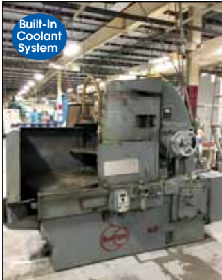
BLANCHARD # 18-36 VERTICAL ROTARY GRINDER