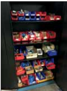
VIEW OF CUTTING TOOLS