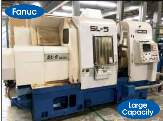
MORI-SEIKI # SL-5 CNC TURNING CENTER