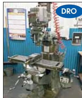
BRIDGEPORT 2 HP-SERIES I VERTICAL MILLER