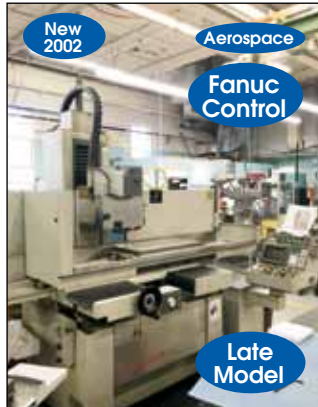
OKAMOTO # ACC-16-32-EXB CNC GRINDER