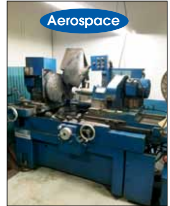
BRYANT "UNIVERSAL" INTERNAL GRINDER