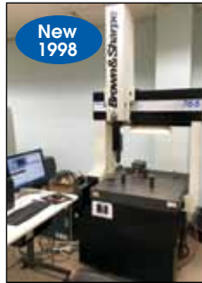
BROWN & SHARPE # MICRO-XCEL 7-6-5 CMM