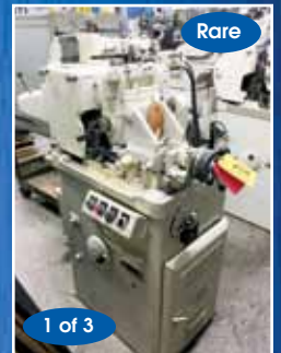
SWI-TRAK # DPM-V-3 CNC MILLING MACHINE