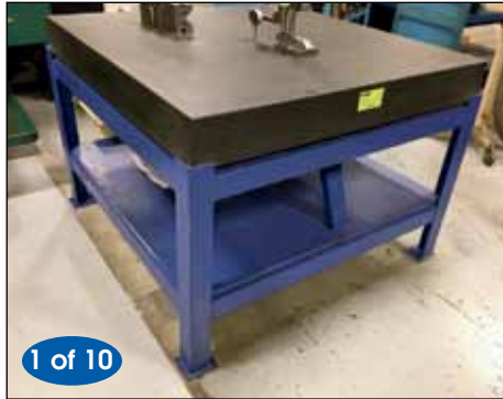
VIEW OF GRANITE INSPECTION PLATE W/ STAND