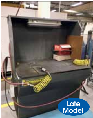
DIVERSI-TECH DOWN DRAFT WORK BENCH