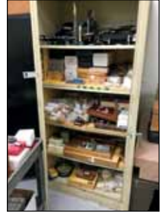
VIEW OF INSPECTION ITEMS

DISCLAIMER: Auctioneer is not responsible for descriptive errors covering specifications, Attachment options, models of assets offered at this auction, additions or deletions. Items offered may not necessarily be sold as described and/or photographed. Buyers should verify all aspects of their potential purchases during inspection as all items offered will be sold "as is, where is" with all faults. Please check with the auctioneer's office for additions or deletions.