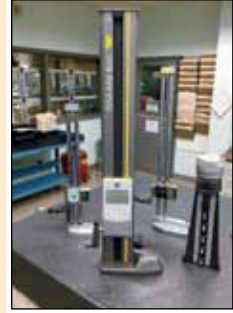
VIEW OF TESA-HITE 600 GAGE & INSPECTION ITEMS