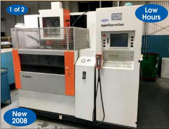
CHARMILLES # FI-440-CC CNC WIRE EDM