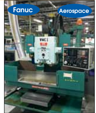
MATSUURA # MC-760V-DC "TWIN SPINDLE" VMC