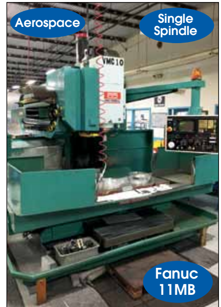
MATSUURA # MC-1000V CNC VMC