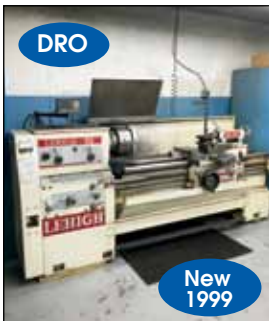
LEHIGH 20"X 60" ENGINE LATHE