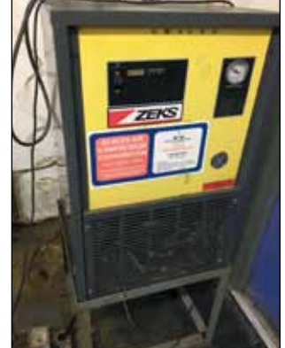
ZEKS AIR DRYER