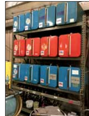
MOHAWK OIL DISTRIBUTION SYSTEM