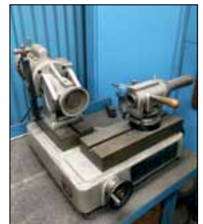
CUTTER-MASTER TOOL GRINDER