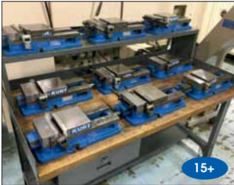
VIEW OF KURT VISES