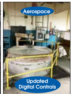
GENERAL ELECTRIC FLOOR TYPE FURNACE