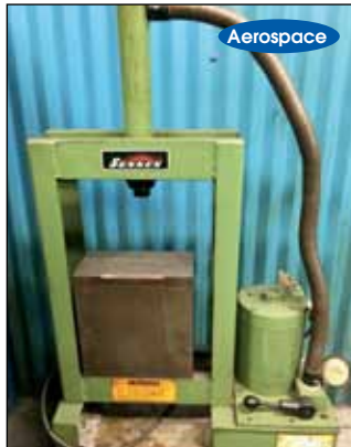
SUNNENS HYD. PRESS