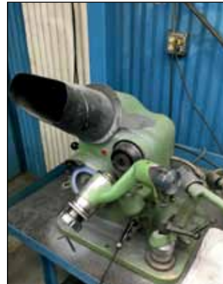
OPTIMA PRECISION TOOL GRINDER