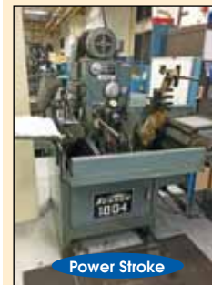
SUNNEN # 1804 HONING MACHINE