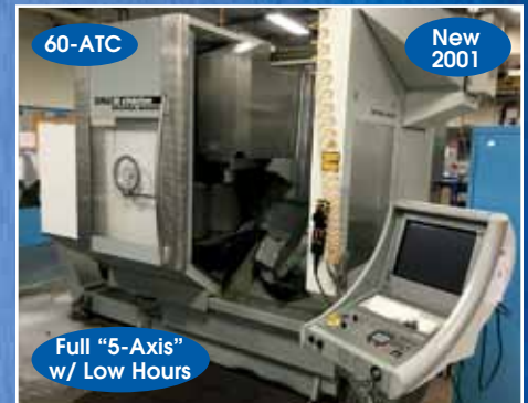
DECKEL-MAHO # DMU-50-EVOLUTION "5-AXIS" CNC VMC