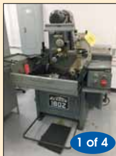
SUNNEN # 1802 HONING MACHINE