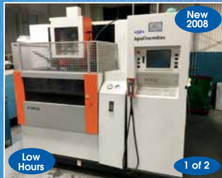
CHARMILLES # FI-440-CC CNC WIRE EDM