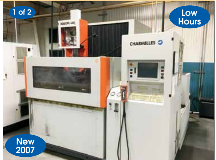
CHARMILLES # ROBOFIL-640-CC CNC WIRE EDM