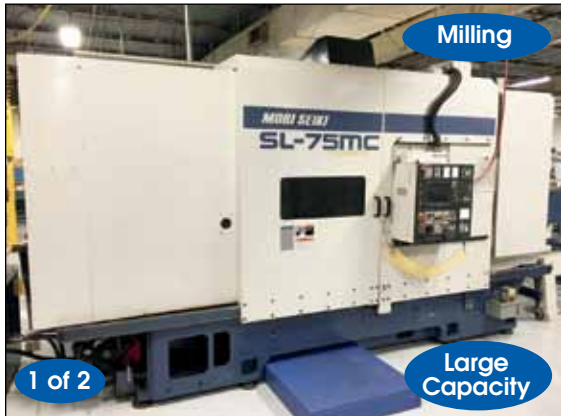
MORI-SEIKI # SL-75-MC CNC TURNING CENTER