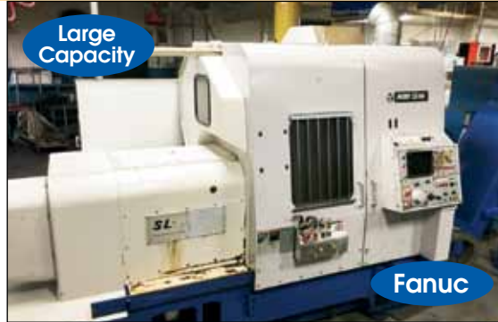
MORI-SEIKI # SL-6 CNC TURNING CENTER