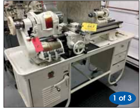
SOUTH BEND TOOL ROOM LATHE