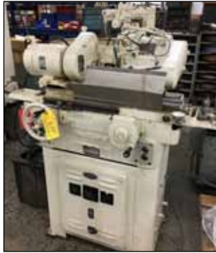
MYFORD # MG-12 O.D. GRINDER