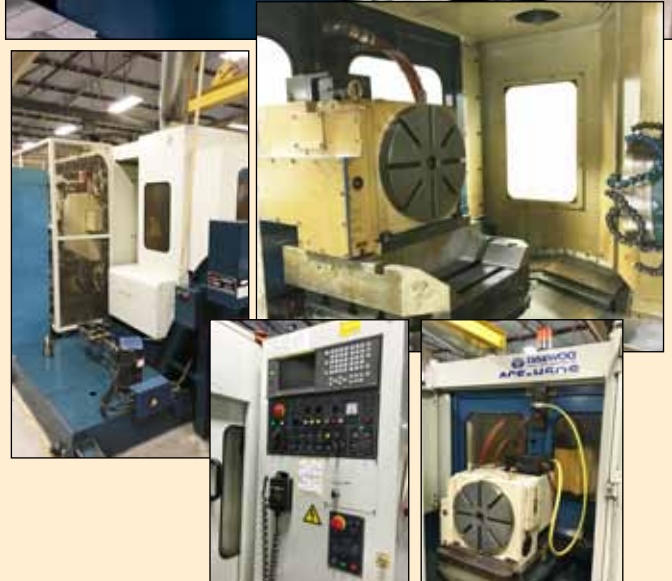
DAEWOO # ACE-H50-S "5-AXIS" CNC HMC