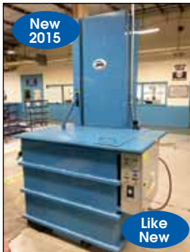
JRI IMMERSION TYPE PARTS WASHING MACHINE