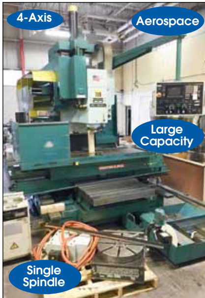
MATSUURA # MC-1500V "4-AXIS" VMC