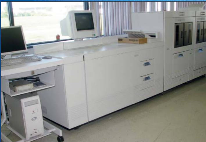
XERO DOCUPRINT 135