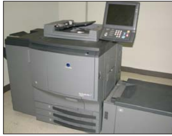
KONICA MINOLTA BIZHUB PRO C6500