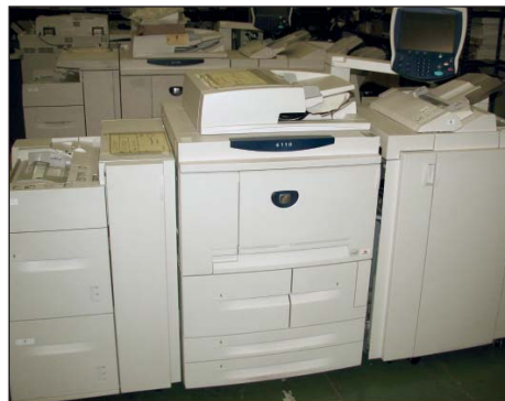
XEROX DOCUCOLOR 4110