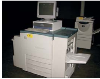
XEROX DOCUPRINT 75