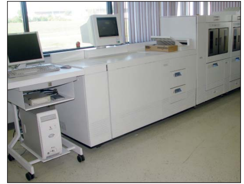
XERO DOCUPRINT 135