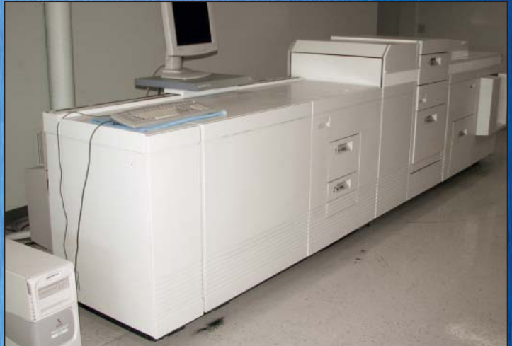
XEROX DOCUTECH 6180