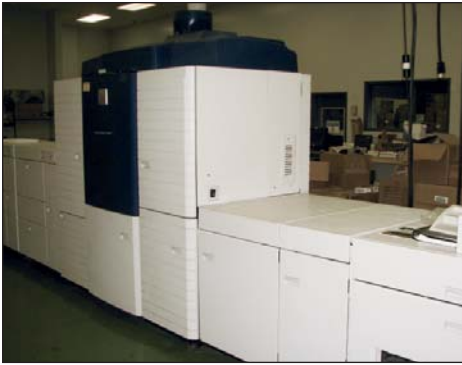
XEROX I-GEN 3