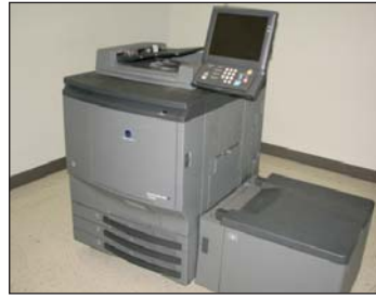
KONICA MINOLTA BIZHUB PRO C6600