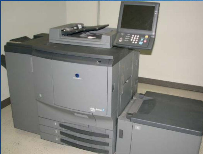
KONICA MINOLTA BIZHUB PRO C6500