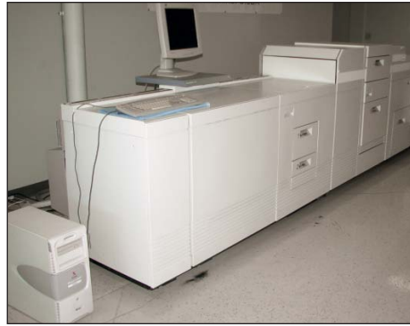
XEROX DOCUTECH 6180