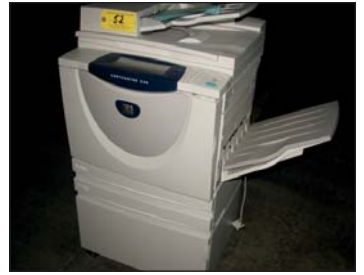
XEROX COPYCENTRE C35