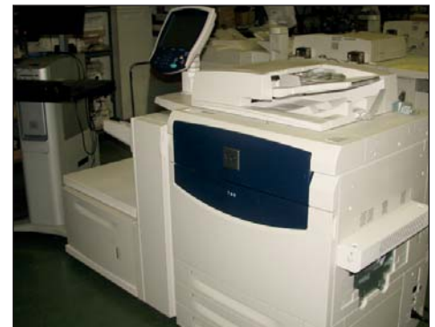
XEROX DOCUCOLOR 700