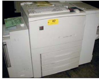
XEROX DOCUPRINT 75MX