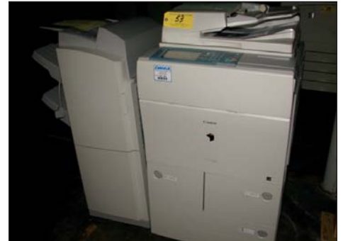
CANON IMAGERUNNER 5050