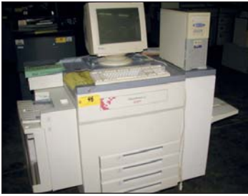
XEROX DOCUPRINT 65