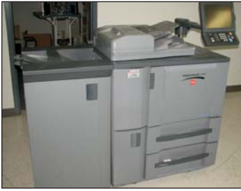
IKON PRINTER CENTER PRO 1050