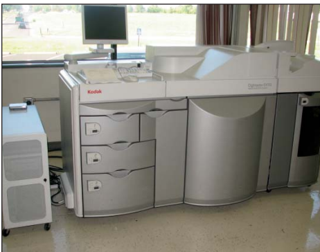
KODAK DIGIMASTER EX110