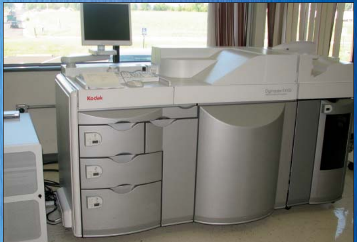
KODAK DIGIMASTER EX110