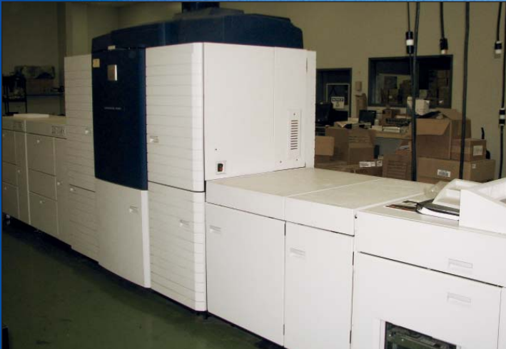
XEROX I-GEN 3