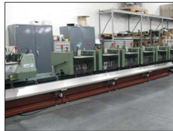
(6) 306 FEEDERS