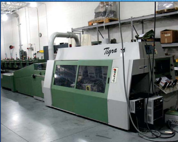
MULLER TIGRA PERFECT BINDER