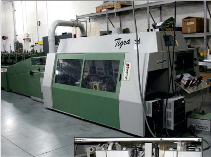
MULLER TIGRA PERFECT BINDER