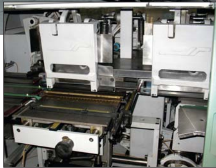
VIEW OF BINDER/CLAMP STATION