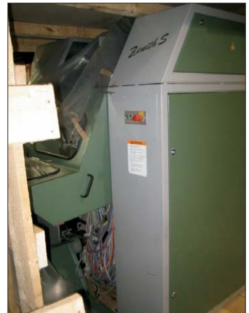
MULLER 3672 ZENITH TRIMMER

DON'T MISS THIS UNIQUE OPPORTUNITY! REGISTER & BID AT: www.thomasauction.com