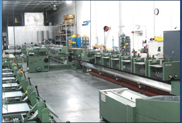
MULLER 321 SADDLE STITCHER