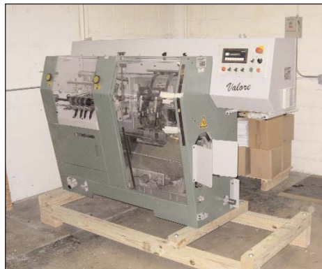
MULLER 1558 VALORE STITCHER