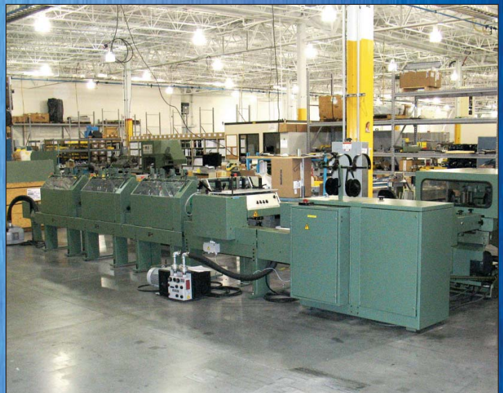
MULLER MINUTEMAN 1509 SADDLE STITCHER