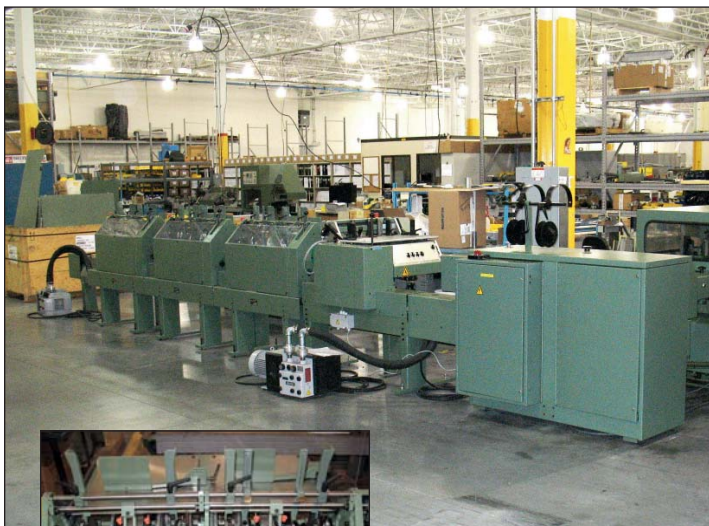
MULLER MINUTEMAN 1509 SADDLE STITCHER