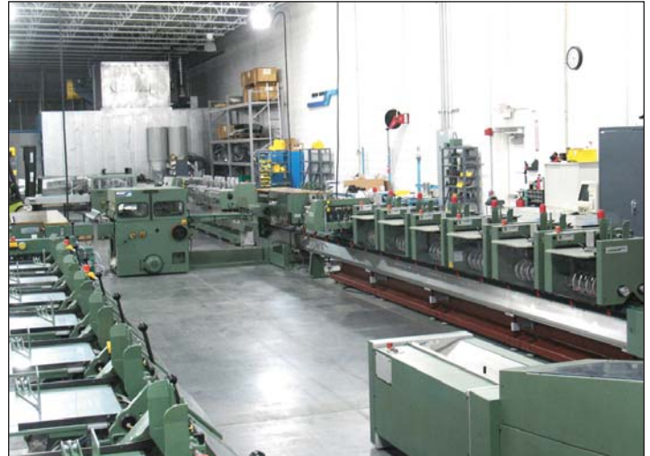
MULLER 321 SADDLE STITCHER