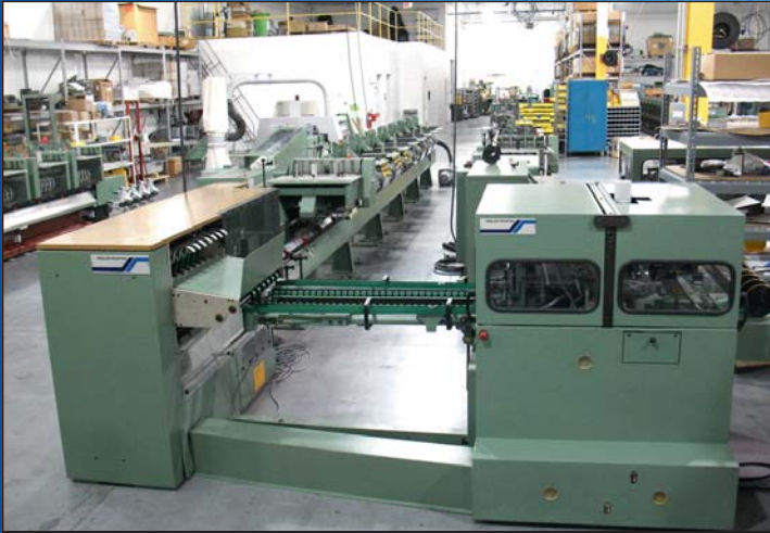
MULLER FOX 321 SADDLE STITCHER

BIDDING CLOSES: THURSDAY, JANUARY 21 - 2:00 PM (ET)