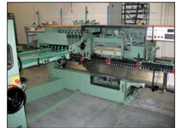
FOX 321 STITCHER W/HK75 HEADS