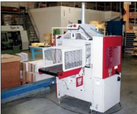
MULLER 3672 ZENITH TRIMMER