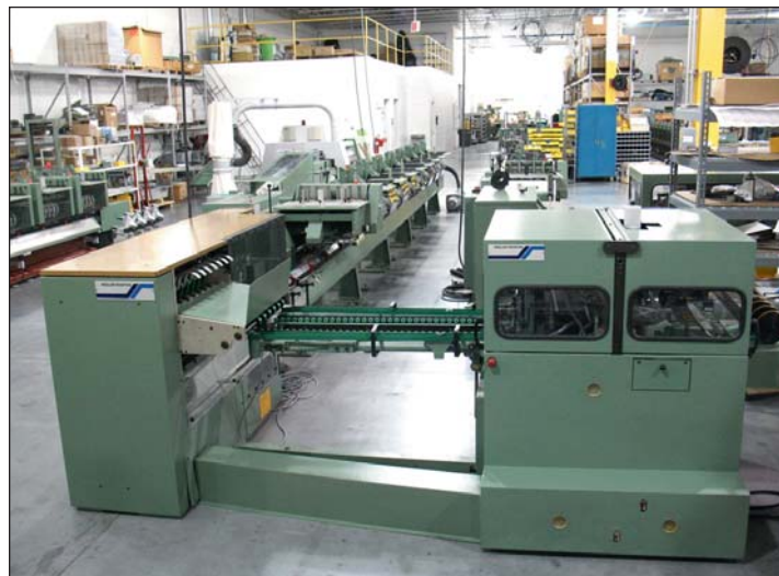
MULLER FOX 321 SADDLE STITCHER