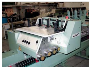
1528 COVER FEEDER