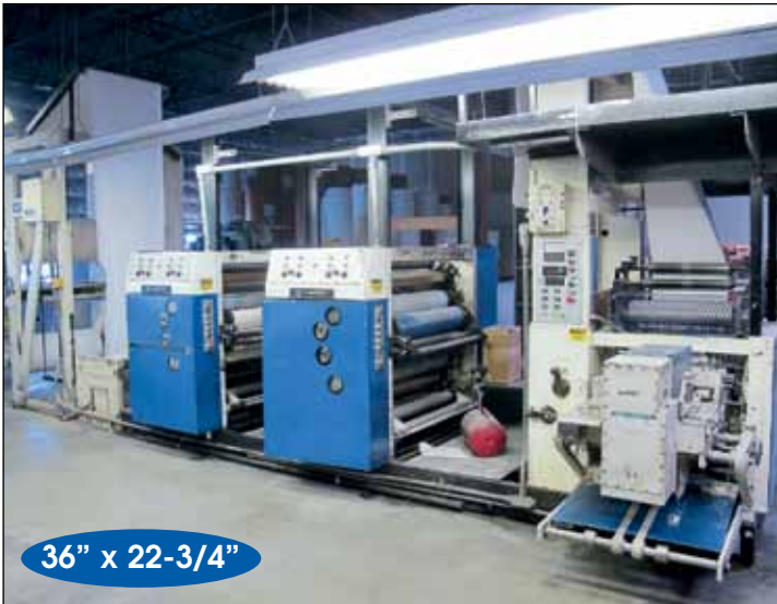
HARRIS WEB PRINTING PRESS MODEL V-25