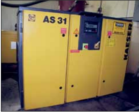
KAESER ROTARY SCREW AIR COMPRESSOR MODEL AS31