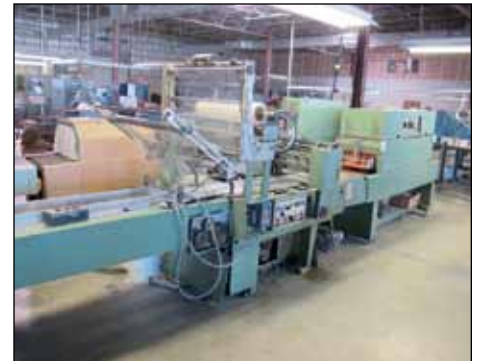
WELDTRON AUTOMATIC PACKAGING MACHINE WITH SHRINK TUNNEL