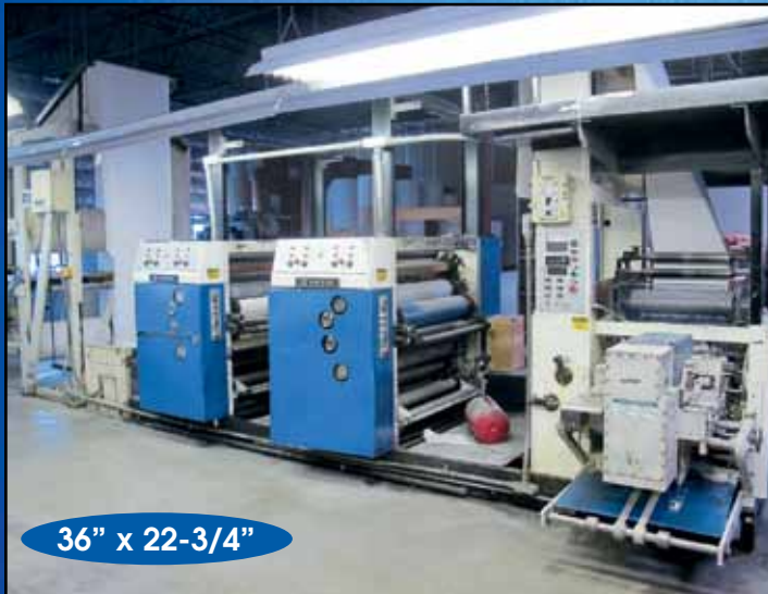
Harris Web Printing Press Model V-25