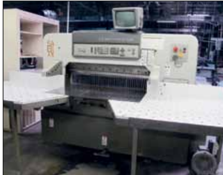
POLAR MOHR PAPER CUTTER MODEL 115-EMC-MON