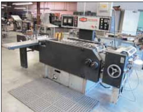
SCOTT TEN THOUSAND AUTOMATIC PLASTIC INDEX TABBING MACHINE