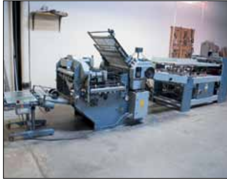
STAHL 30" FOLDER MODEL RF66V