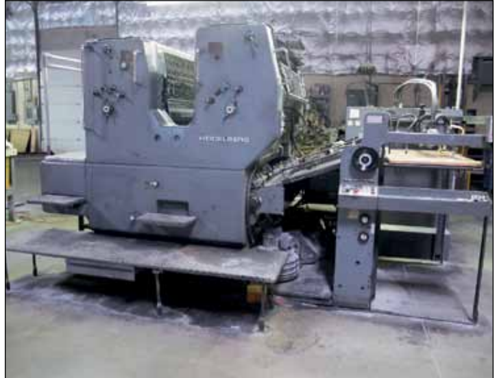
HEIDELBERG 2-COLOR SHEET FED PRINTING PRESS MODEL SORSZ