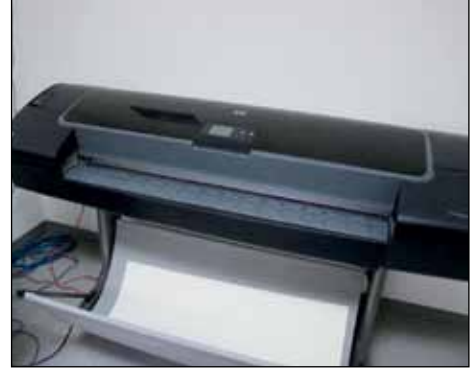
HP DESIGN JET Z2100 PROOFER