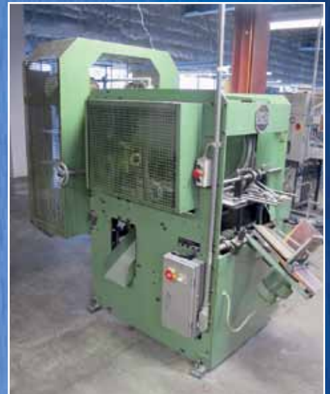
Kugler Auto Punch