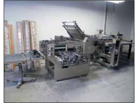
SHOEI STAR 26" FOLDER