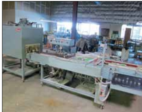
SHANKLIN L-SEAL PACKAGING MACHINE WITH SHRINK TUNNEL