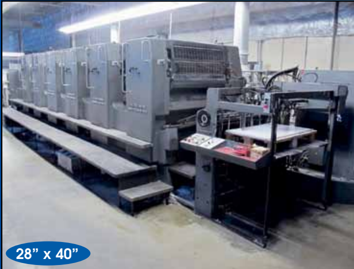
Heidelberg 6-Color Sheet Fed Printing Press Model 102SP

INSPECTION DATE: WEDNESDAY, MARCH 22, 9 AM TO 4 PM (ET)