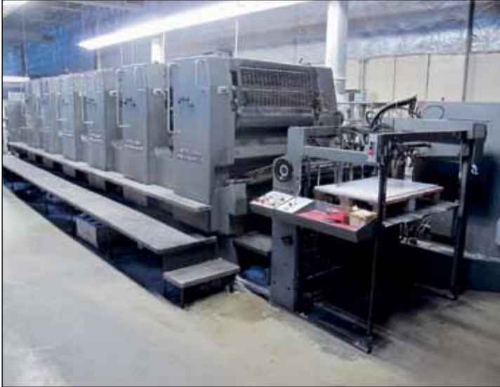
HEIDELBERG 6-COLOR SHEET FED PRINTING PRESS MODEL 102SP

SALE DATE: THURSDAY, MARCH 23 (ET) FIRST LOT CLOSSES AT 1:00 PM