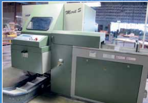
Muller Martini Merit S 3-Knife Trimmer

INSPECTION DATE: WEDNESDAY, MARCH 22, 9 AM TO 4 PM (ET)