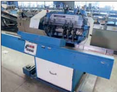
LAWSON HEAVY DUTY CLASSIC DRILL, 5-SPINDLE