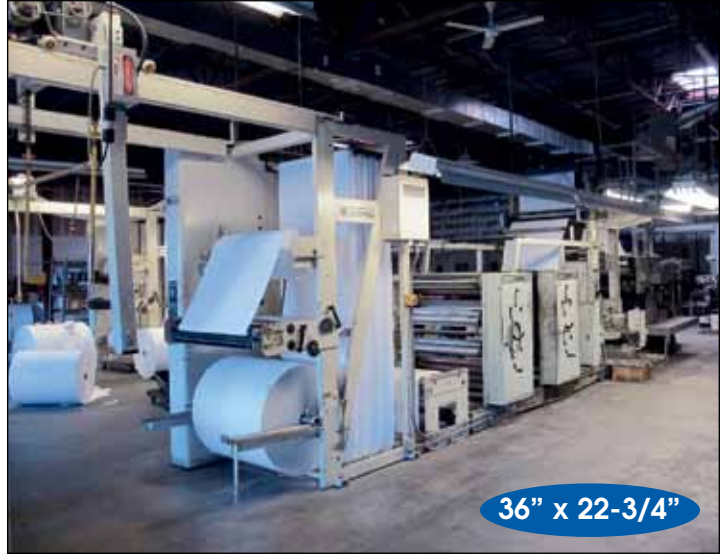
HARRIS WEB PRINTING PRESS MODEL V-15A