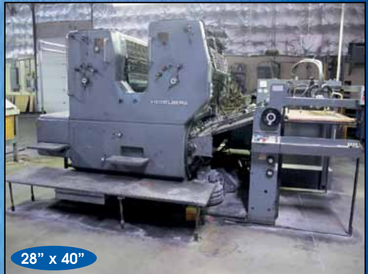
Heidelberg 2-Color Sheet Fed Printing Press Model SORSZ