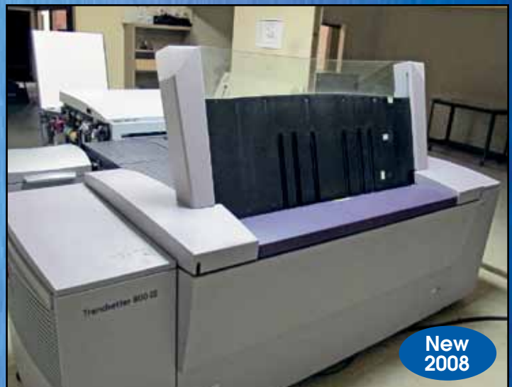
Kodak CTP System Model Trendsetter TSM800-III