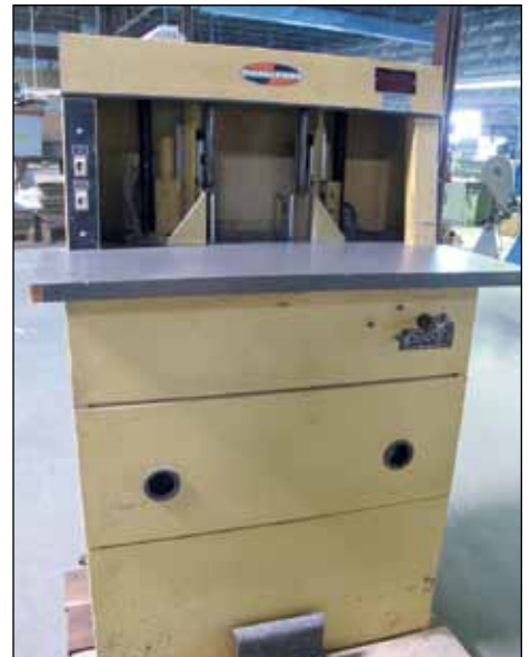
CHALLENGE ROUND CORNER MACHINE

Kugler Auto Punch S/N 936-340-2 (Late 90's Vintage)