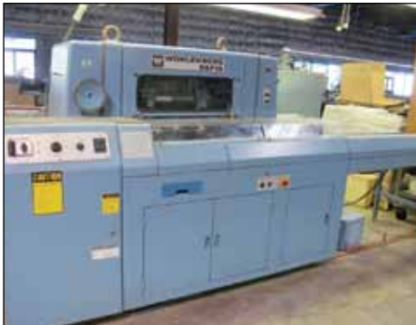
WOHLENBERG RAPID 3-KNIFE TRIMMER MODEL 44FM50