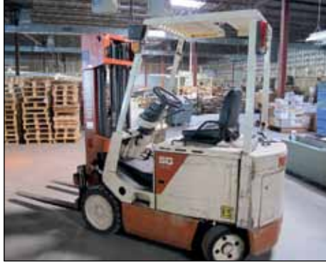
NISSAN 5000 LB. ELECTRIC FORKLIFT, MODEL 50