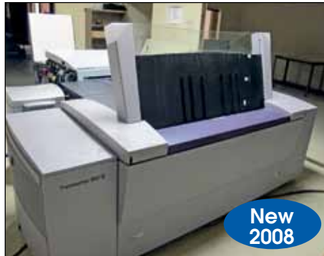
KODAK CTP SYSTEM MODEL TRENDSETTER TSM800-III