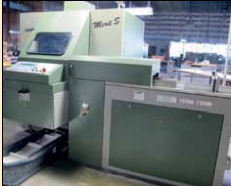
MULLER MARTINI STAR PERFECT BINDER