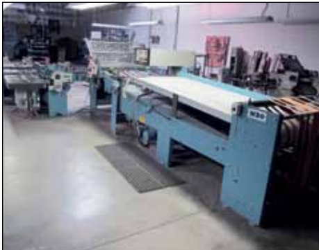
MBO 40" FOLDER, 16-PAGE