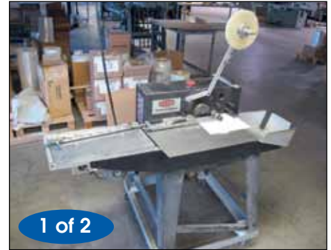
SCOTT E-Z MACHINE MYLAR REINFORCING MACHINE