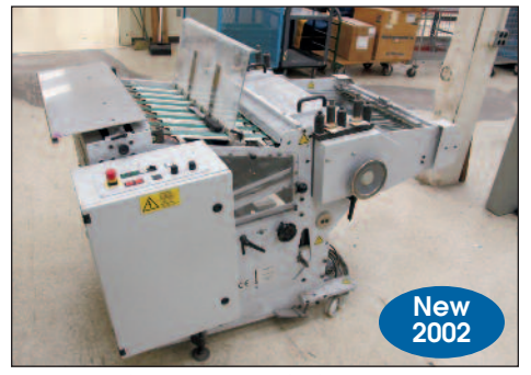
Heidelberg Stacker Model VSA.3.66