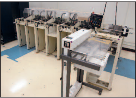
CP Bourg Cadremain 6-Station Collator