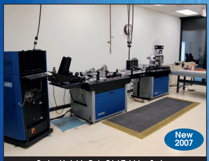
Buskro Variable Data Print/Tabbing System