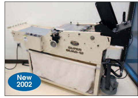
Thermo-Type Slitter Model Super Quad 12