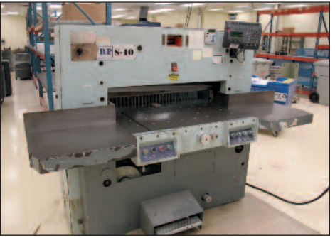
Robert & Porter S-40 Cutter