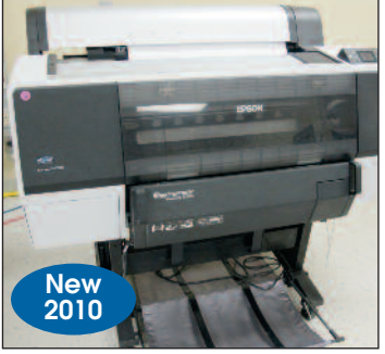
Epson Proofer Model 7900