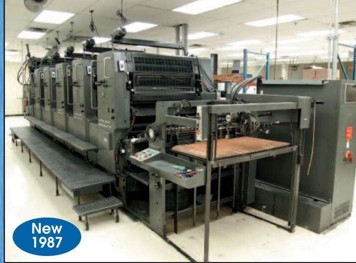
Heidelberg 102FP Sheet Fed Printing Press