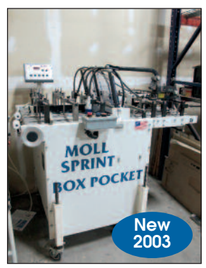
Moll Sprint Box Pocket Folder/Gluer