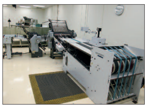
Stahl TF65.3/4-4-4-RF-N Folder