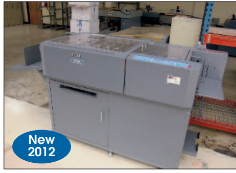
Duplo DC-645 Slitter/Cutter/Creaser