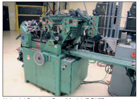
Halm Jet Envelope Press Model JP-TW9D