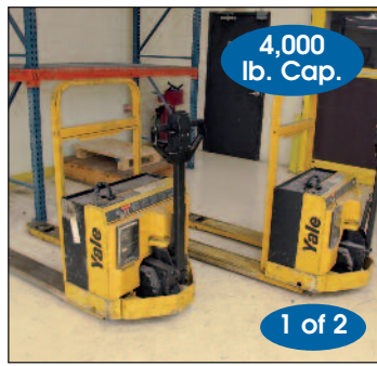
Yale MPB040 Electric Pallet Jacks