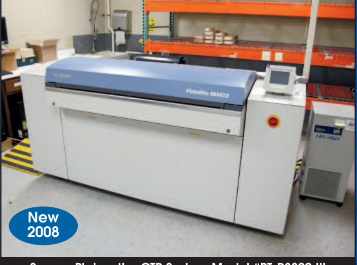
Screen Platesetter CTP System Model #PT-R8800 III