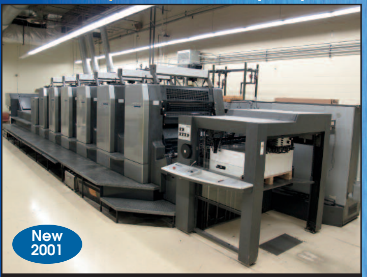
Heidelberg CD 102-6 LX Sheet Fed Printing Press

Inspection: Monday, September 8, 9 AM to 4 PM (Local Time)