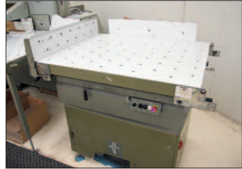
Polar/Mohr Paper Jogger Model RB5