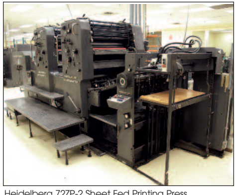
Heidelberg 72ZP-2 Sheet Fed Printing Press