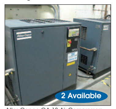
Atlas Copco GA-18 Air Compressors