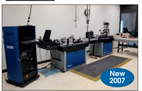
Buskro Variable Data Print/Tabbing System