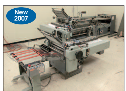
Heidelberg Stahl 1426F-C-3 6/4 Folder