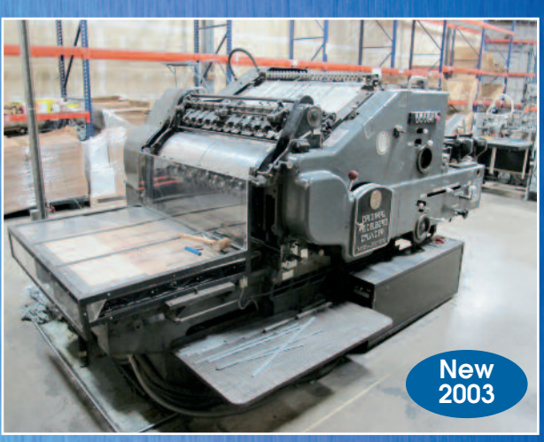
Heidelberg SBD DieCutter, 25-1/4" x 35-3/8"