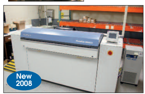
Screen Platesetter CTP System Model #PT-R8800 III