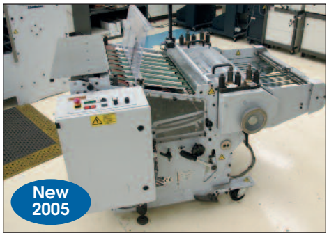
Heidelberg Stacker/Crusher Model #VSA-66