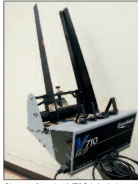
Streamfeeder V710 Ink Jet Friction Feeder