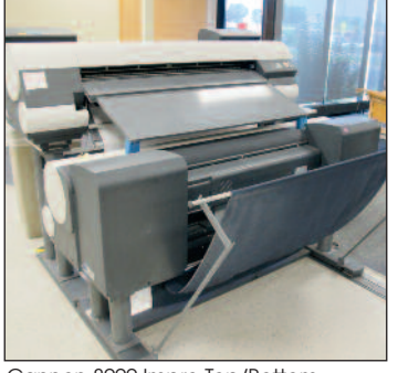
Cannon 8000 Impro Top/Bottom Proofing System