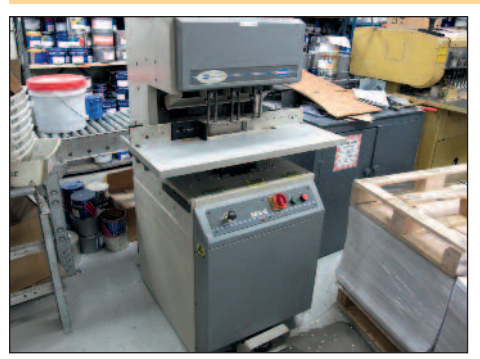
Challenge Drill Model MS-5