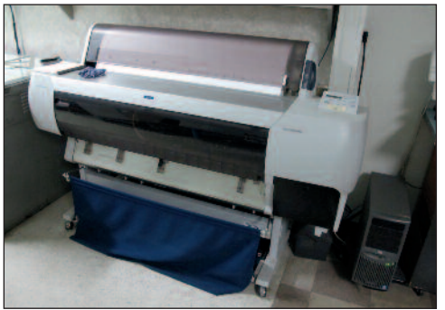
Epson Stylus Pro 9900 Proofer