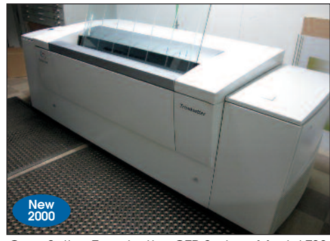
Creo Scitex Trendsetter CTP System Model TS8