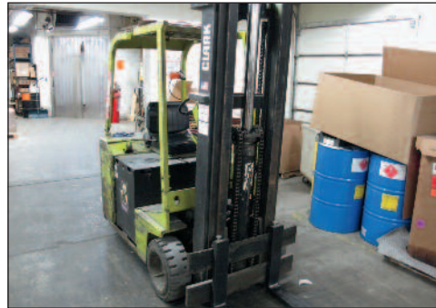
Clark 3,550 Lb Electric Forklift Model TW40B