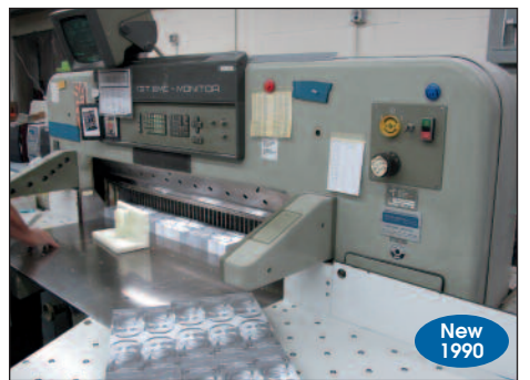
Polar Mohr Paper Cutter Model 137EMC-MON Lawson 36" Paper Cutter