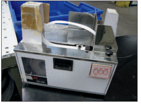
Felins Taping Machine Model JD-240-30