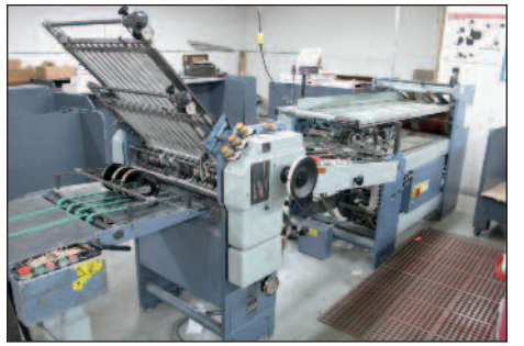
Stahl Folder Model TF66, 6/4/4