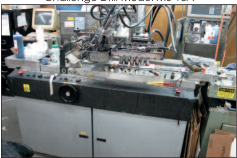
Videojet Inkjet Print System w/(3)Excel 270G Print Engines