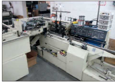
Harris Saddle Stitcher Line Model Saddlebinder II 562-6