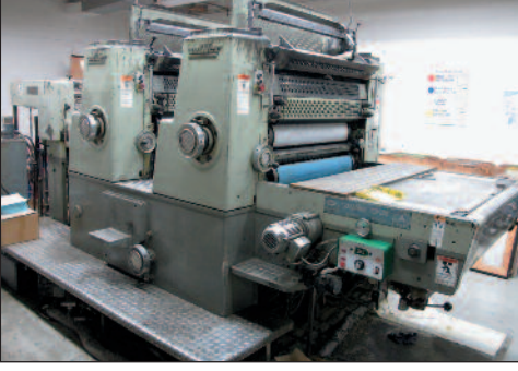
Miller TP36 Sheet Fed Printing Press, 2/C