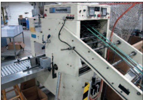
Harris Compensating Stacker