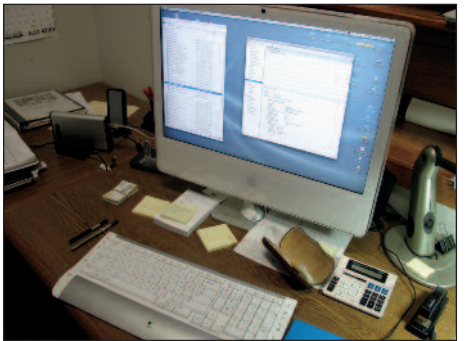
Apple G5 Power PC