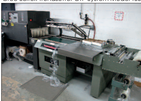
Weldotron Packaging Machine Model 5312