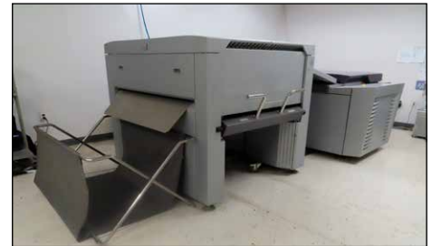
KODAK MAGNUS 800 CTP SYSTEM