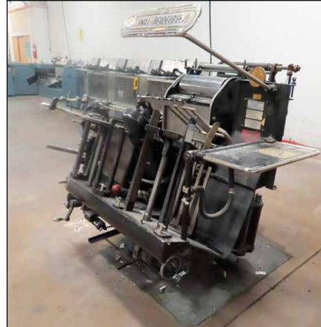
ORIGINAL HEIDELBERG WINDMILL PRESS