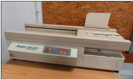
DUPLO PERFECT BINDER MODEL DB-250