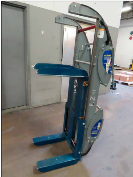
EZ-TURNER PILE TURNER MODEL EZ41