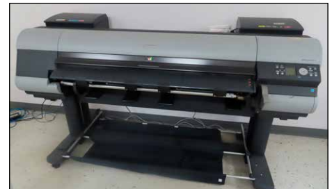
CANON IPF8000S PROOFER