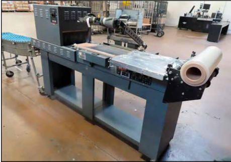
HEATSEAL L-SEAL PACKAGING MACHINE