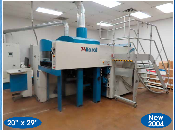
KBA Karat 74 Sheet Fed Printing Press