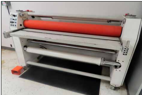
SEAL IMAGE 600 61" LAMINATOR