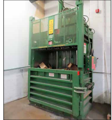
PIQUA VERTICAL HYDRAULIC BALER