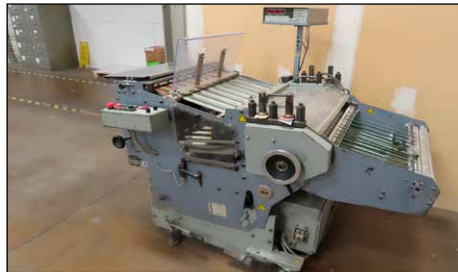
STAHL VSA-M66.1 STACKER DELIVERY UNIT