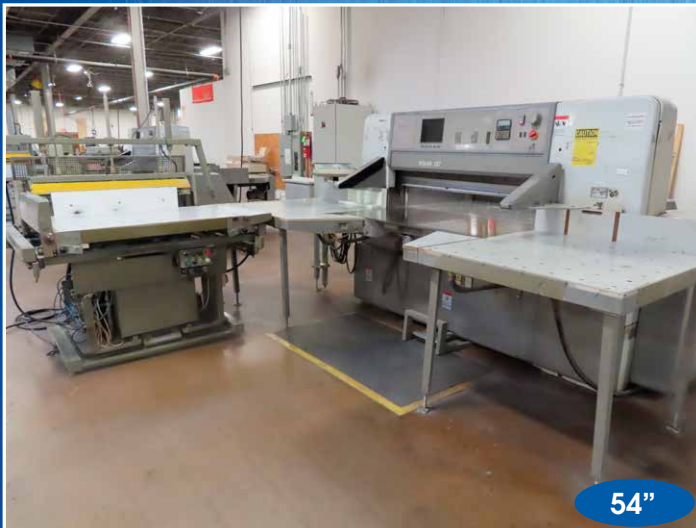
Polar 137ED Paper Cutter with Lift