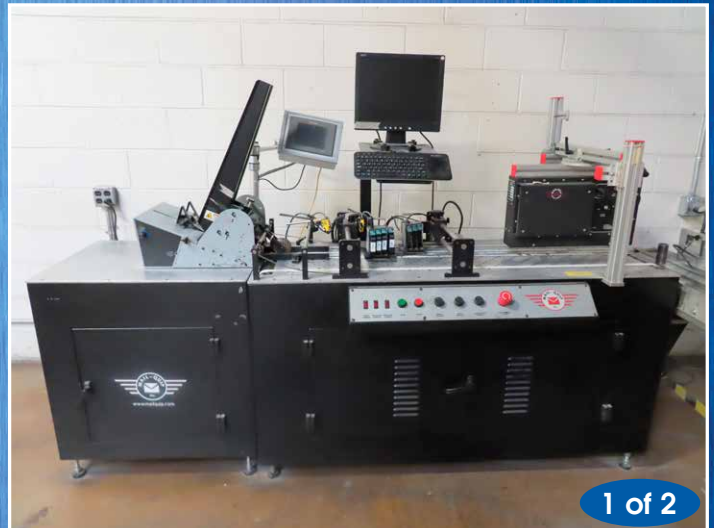
Mail-Quip Variable Data Print System