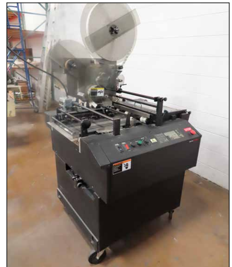
CHESHIRE 2" TLS TABBING MACHINE