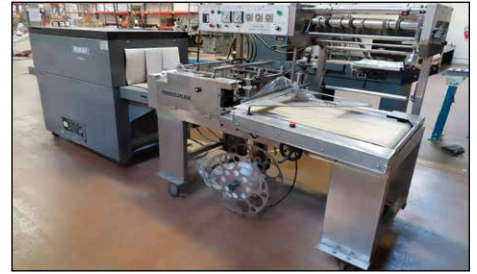
CONFLEX L-SEAL PACKAGING MACHINE MODEL E-250USA