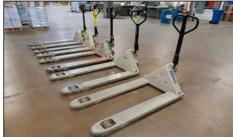
(5+) HYDRAULIC PALLET JACKS