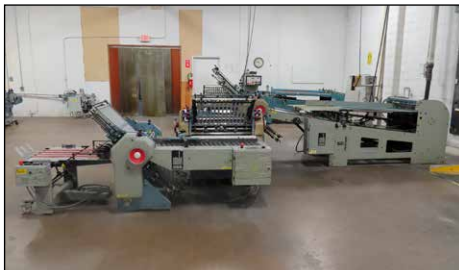
STAHL 1426B FOLDER, CONTINUOUS FEED, 4/4/4