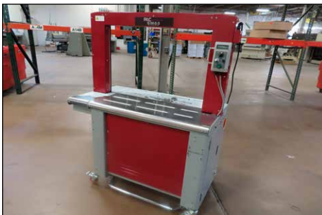
PAC SM65 STRAPPING MACHINE