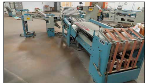
MBO B23 FOLDER, CONTINUOUS FEED, 4/4