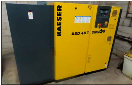
KAESER ASD40T ROTARY SCREW AIR COMPRESSOR