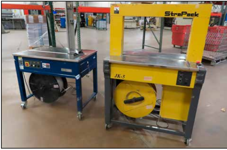
STRAPACK JK5 AND POLYCHEM PC102 STRAPPING MACHINES