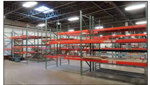
VIEW OF HEAVY DUTY PALLET RACKING