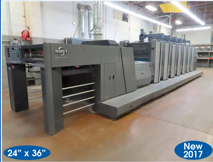
Ryobi 926+CX Printing Press - Private Sale Only

INSPECTION: WEDNESDAY, JANUARY 27, 9 AM TO 4 PM