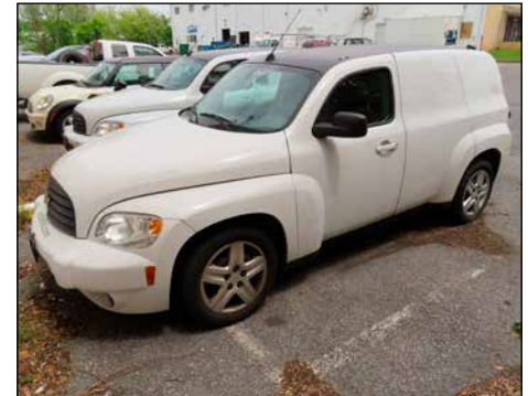
CHEVY HHR SEDAN