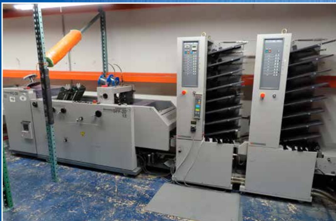
Horizon Booklet Maker w/(2) MC80 Towers

SALE DATE: Thursday, June 11, 1:00 PM (ET) INSPECTION: Wednesday, June 10, 9 AM TO 4 PM