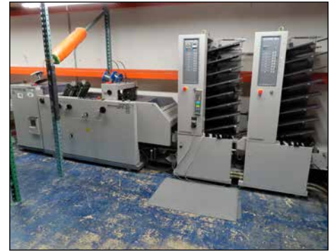
HORIZON BOOKLET MAKER W/(2) MC80 TOWERS