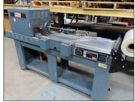
HEAT SEAL L-SEAL PACKAGING MACHINE MODEL HS-115T