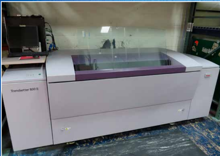
Kodak/Creo CTP System Model Trendsetter 800 II