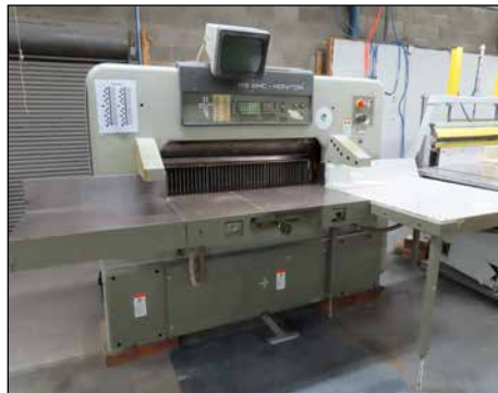
POLAR MOHR 45" PAPER CUTTER MODEL 115-MON