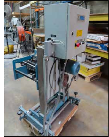
MBO AIR KNIFE FOLD ATTACHMENT