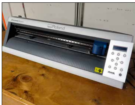
ROLAND 24" VINYL CUTTER/PLOTTER CAMM-1 SERVO GX-24