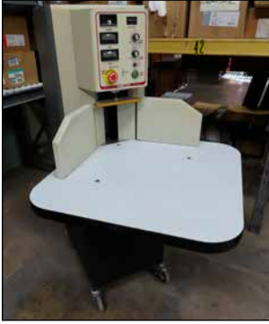
US PAPER COUNTER MODEL CW-1