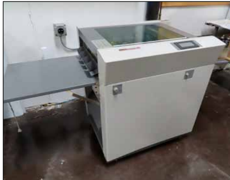
AEROCUTT CARD CUTTER/CREASER