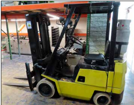
KOMATSU 3000 LB LPG FORKLIFT MODEL FG15S-2