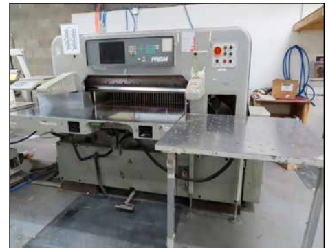
PRISM 45" PAPER CUTTER MODEL QZK-1150-J