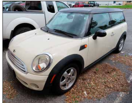
COOPER MINI SEDAN