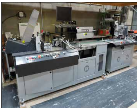
KIRK-RUDY VARIABLE DATA PRINT/TAB LINE