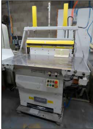
KNORR SYSTEMS JOGGER MODEL RLA