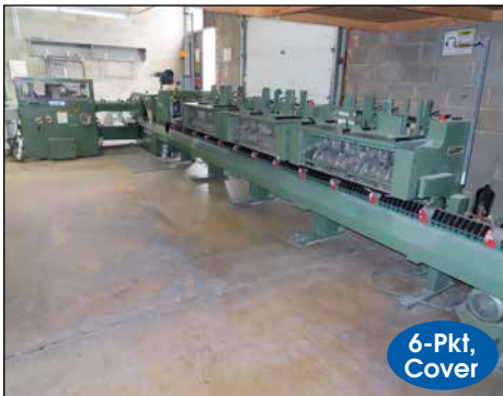
MULLER MARTINI MINUTEMAN SADDLE STITCHER