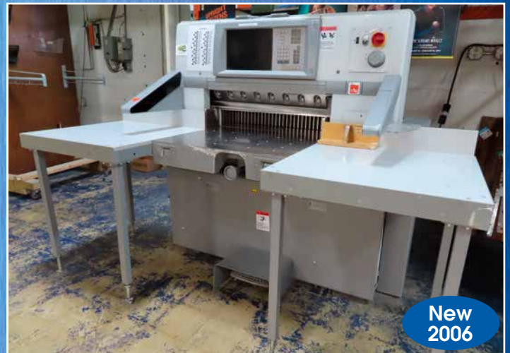
Polar Mohr 30" Paper Cutter Model 78X