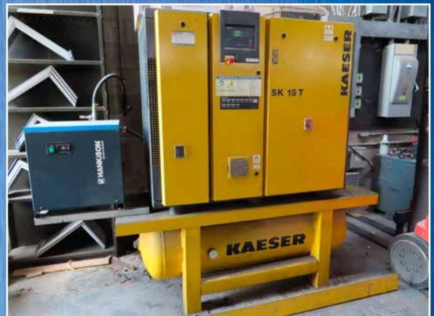
Kaeser 15 HP Air Compressor Model SK15T