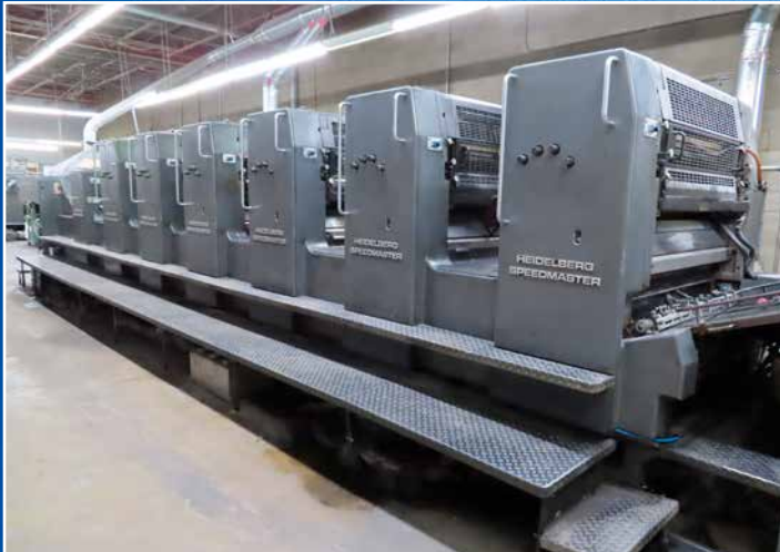
Heidelberg 6/C Printing Press Model SM102S+L

2618 Pittman Drive, Silver Spring, Maryland 20910