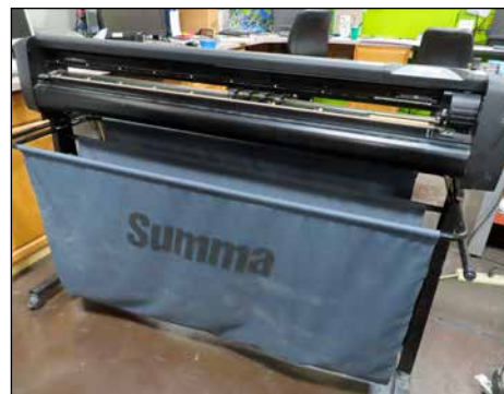
SUMMA 54" VINYL CUTTER/PLOTTER MODEL D140R