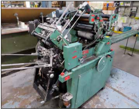
HALM SUPER JET 2/COLOR ENVELOPE PRESS #JP-TWOD-P