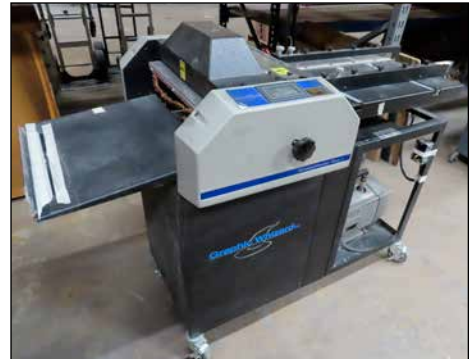
GRAPHIC WHIZARD CREASER MODEL CM PLUS-TS