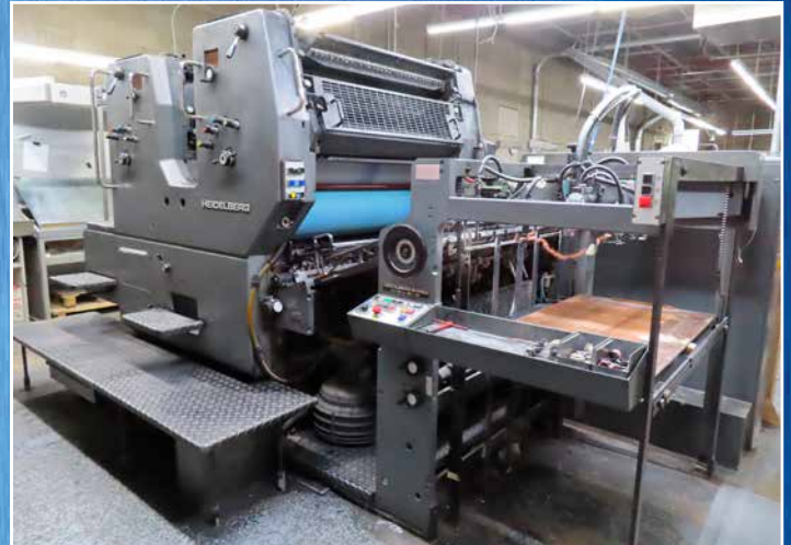
Heidelberg 2/C Printing Press Model SORSZ