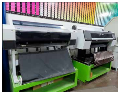
EPSON P8000 AND 9880 PROOFER