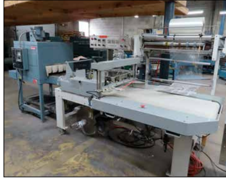
TEXWRAP HI-SPEED SHRINK WRAPPER MODEL 3022