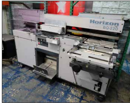
HORIZON PERFECT BINDER MODEL BQ-220