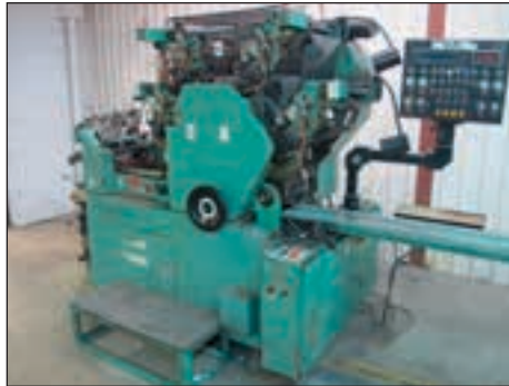
Halm Super Jet 4/C Envelope Press Model JP-FWOD