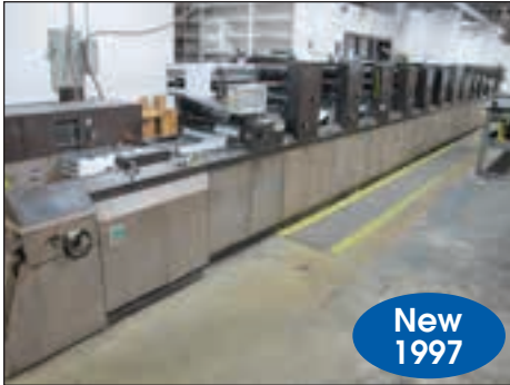
Didde Web Printing Press Model DG175