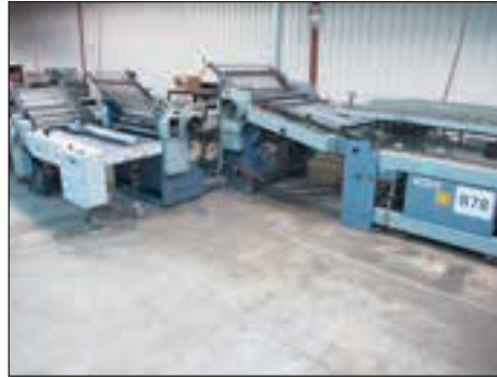
Stahl Folder Model TFU94, 4/4/4