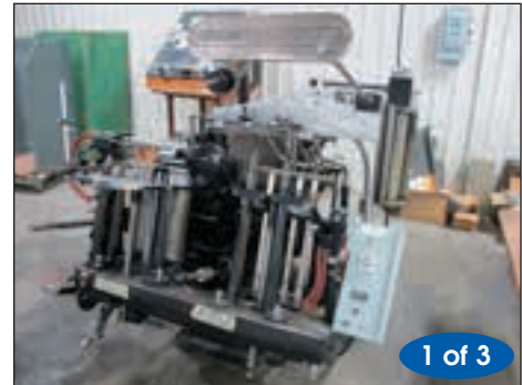
Original Heidelberg Windmill Press w/Foiling