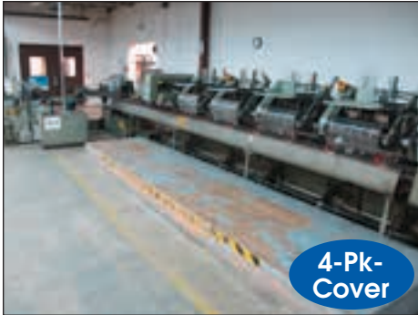
Muller Martini Saddle Stitcher Line Model JGV