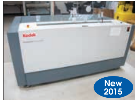
Kodak Trendsetter Platesetter CTP System