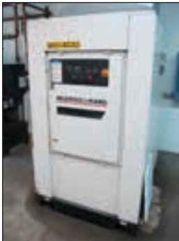
Ingersoll Rand 50 HP Rotary Screw Air Compressor Model SSR-EP50SE