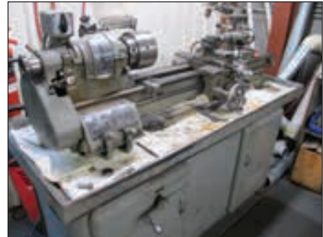
Southbend Lathe Model CL187RB