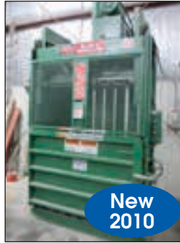
PTR Vertical Baler Model 2300HD