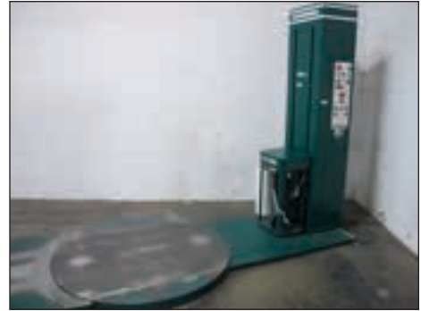
InfraPak Sidewinder Rotary Stretch Pallet Wrapper