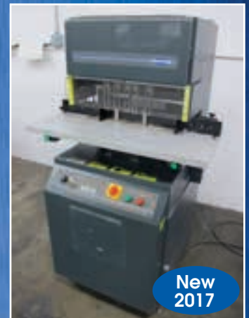
Challenge 5 Spindle Drill Model MS