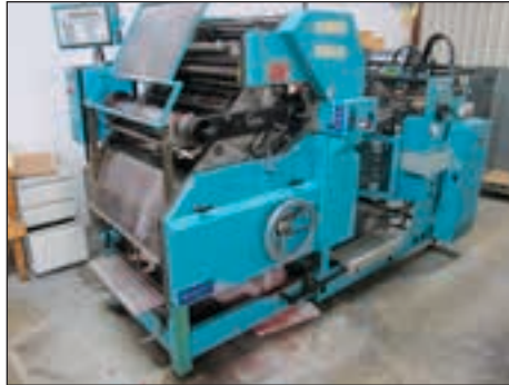
Heath Custom Numbering Press