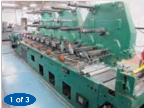
Hamilton Forms Collator