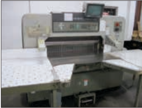
Polar Mohr Paper Cutter Model 115EMC MON