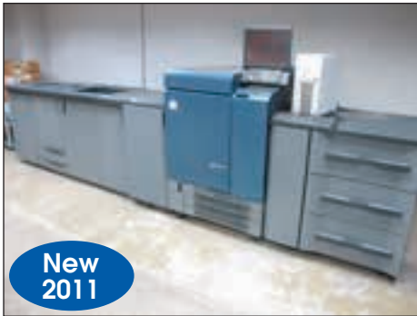
Konica Minolta Biz Hub C8000 Digital Print System