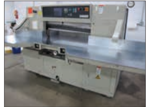
Saber Paper Cutter Model S115