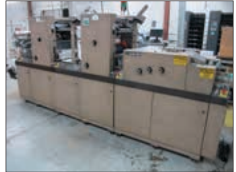
Didde 2-Unit Web Press Model Apollo MCP