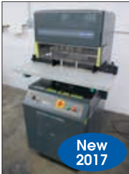
Challenge 5 Spindle Drill Model MS