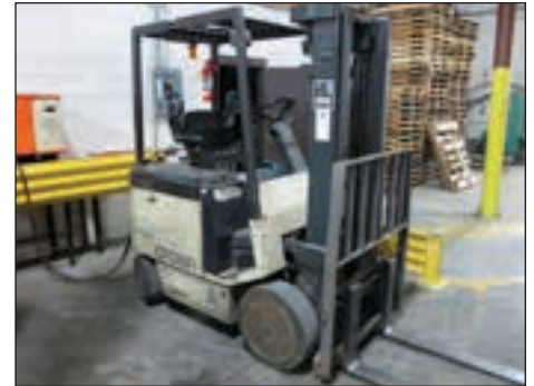
Crown Electric Forklift Truck Model FC

Ingersoll Rand Compressed Air Dryer Model DXR150, S/N 97KDXR5176 (New 1997)