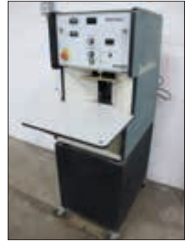
US Paper Counter Paper Counter Model Bantam-1