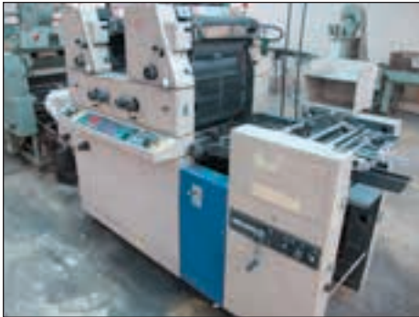
Ryobi 2-Color Press Model 3202MM