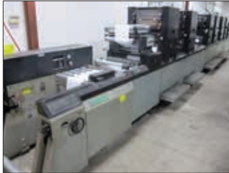
Didde Web Press Model DGS860MCM