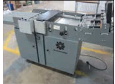
Sunraise Slitter w/ Multi Lane Delivery