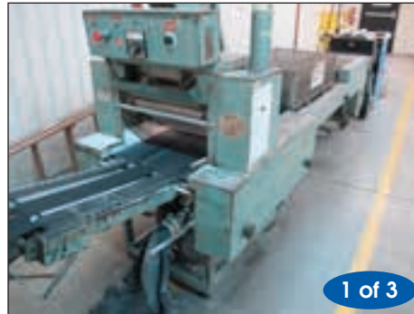
Virkotype Thermography Machine Model C15E