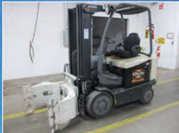
Crown Roll Clamp Truck Model FC4500