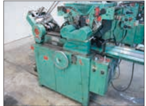
Halm Jet 2-Color Envelope Press Model JP-TWOD-6