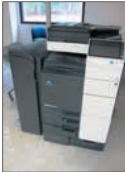
Konica Minolta Biz Hub C654 Copy Machine