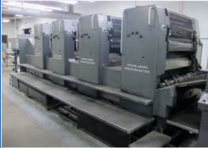
Heidelberg 4/C Printing Press Model 102VP