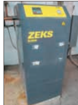
Zeks Heat Sink Compressed Air Dryer Model 250HSGA500