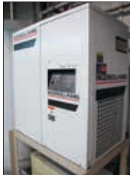
Ingersoll Rand Compressed Air Dryer Model DXR150