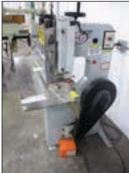
Deluxe 2-Head Wire Stitcher Model G20/M27