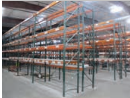
(150+) Section HD Pallet Racking