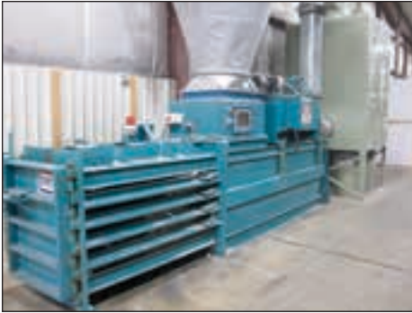
KMF Horizontal Baler Model HOR3040X