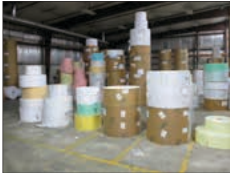
View of Paper Roll Stock