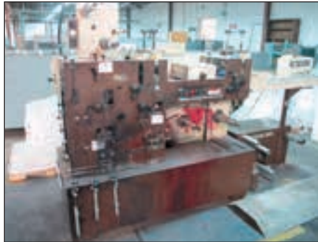
Mark Andy Flexo Press Model 833867-205