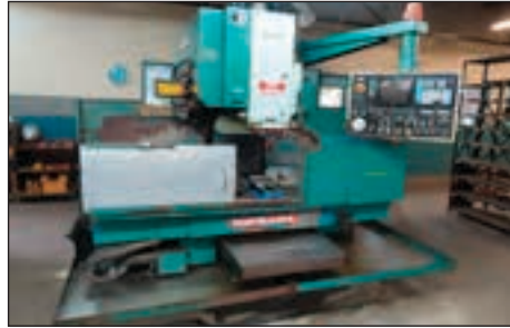
MATSUURA 3 AXIS VERTICAL MACHINING CENTER MODEL MC-760V2