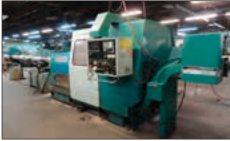
NAKAMURA CNC TURNING CENTER MODEL S-3B