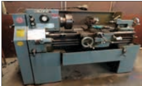
LEBLOND REGAL 16" X 32" LATHE MODEL 11C