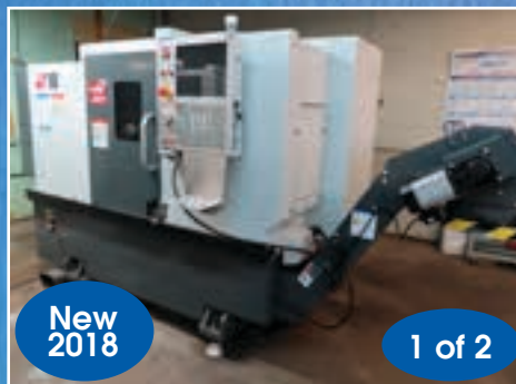
HAAS 2 AXIS CNC TURNING CENTER MODEL ST-10

INSPECTION: WEDNESDAY, NOVEMBER 6, 9 AM TO 4 PM (ET)