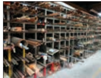
RAW MATERIAL INVENTORY