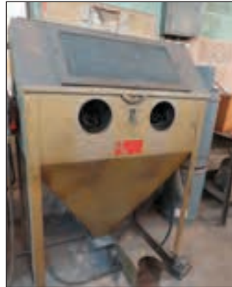
TRINCO BLAST CABINET MODEL 35BP2