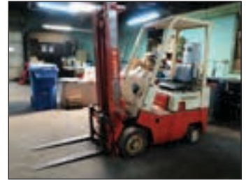
DATSUN 3,000 LB LPG FORKLIFT MODEL CFO1A15V