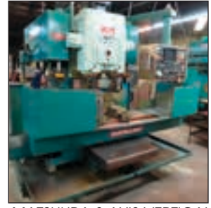
MATSUURA 3 AXIS VERTICAL MACHINING CENTER MODEL MC-760V-DC