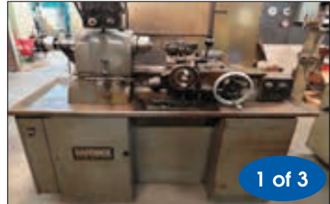
HARDINGE TURRET LATHE MODEL HC