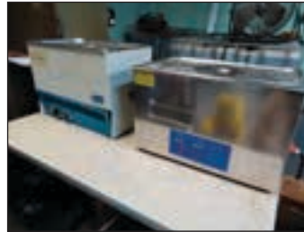
VEVOR AND SONICOR ULTRASONIC CLEANING TANKS