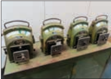
SUNNEN PG-810/800 PRECISION HOLE GAGES