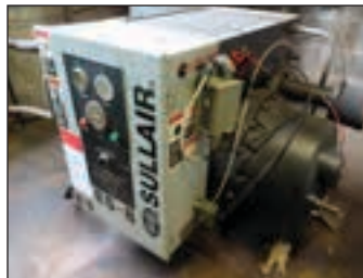
SULLAIR 25 HP ROTARY SCREW AIR COMPRESSOR MODEL ES-8-25H