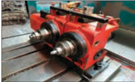
HAAS 5C INDEXER