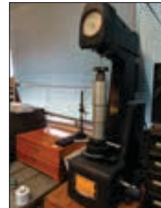
WILSON HARDNESS TESTER