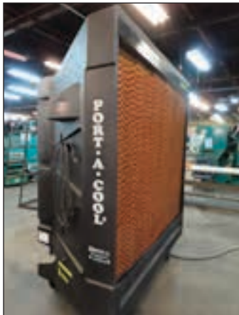
PORT-A-COOL INDUSTRIAL FAN