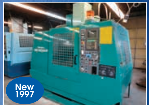
MATSUURA 3 AXIS VERTICAL MACHINING CENTER MODEL MC-800VF