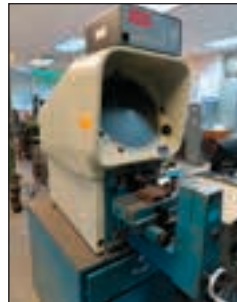
DELTRONIC DH14-MPC COMPARATOR