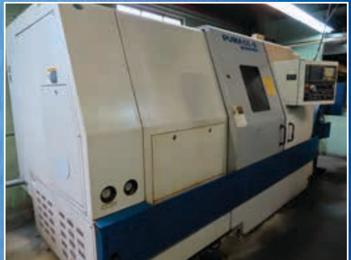
Daewoo 2 Axis CNC Lathe Model Puma 12L-B