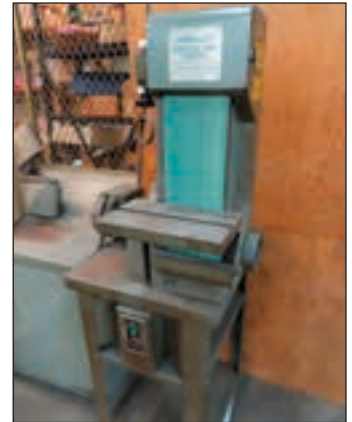
HAMMOND 6" ABRASIVE BELT GRINDER #600-D