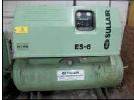
SULLAIR ES-6 ROTARY SCREW AIR COMPRESSOR HORIZONTAL TANK MOUNTED, 10 HP