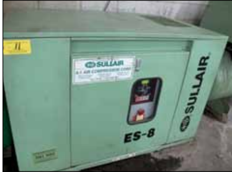
SULLAIR ES-8 ROTARY SCREW AIR COMPRESSOR, 15 HP