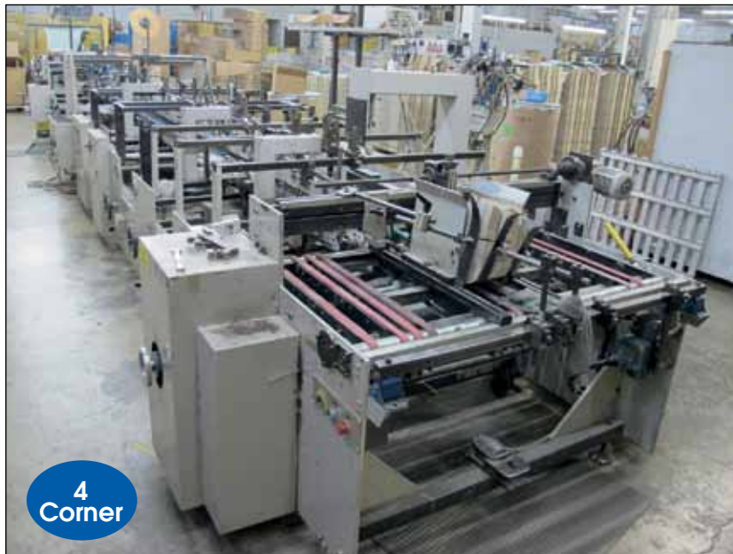
BOBST DOMINO 110M FOLDER/GLUER