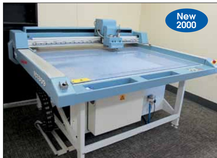
KONGSBERG/BARCO SAMPLE MAKER MOD FC1309