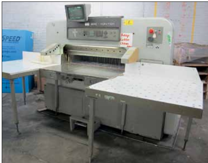
POLAR MOHR 45" PAPER CUTTER MODEL 115MON