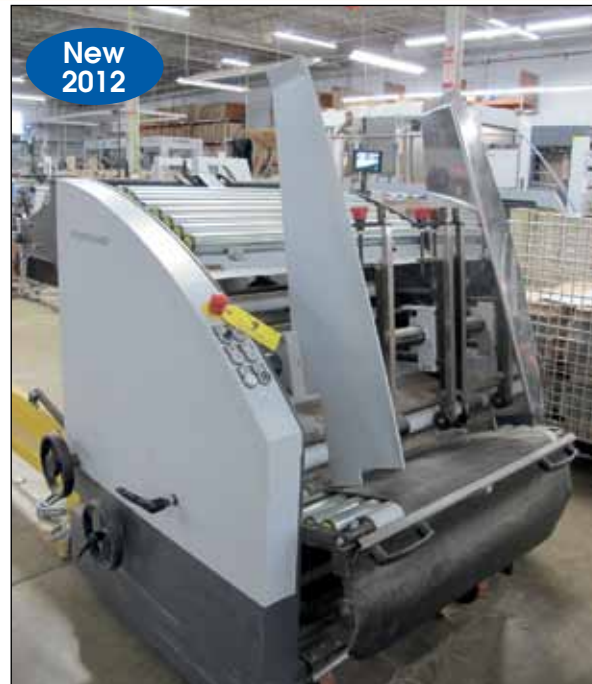
HEIDELBERG DIANA FOLDER/GLUER FEEDER UNIT