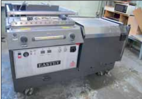
EASTEY L-SEAL PACKAGING MACHINE