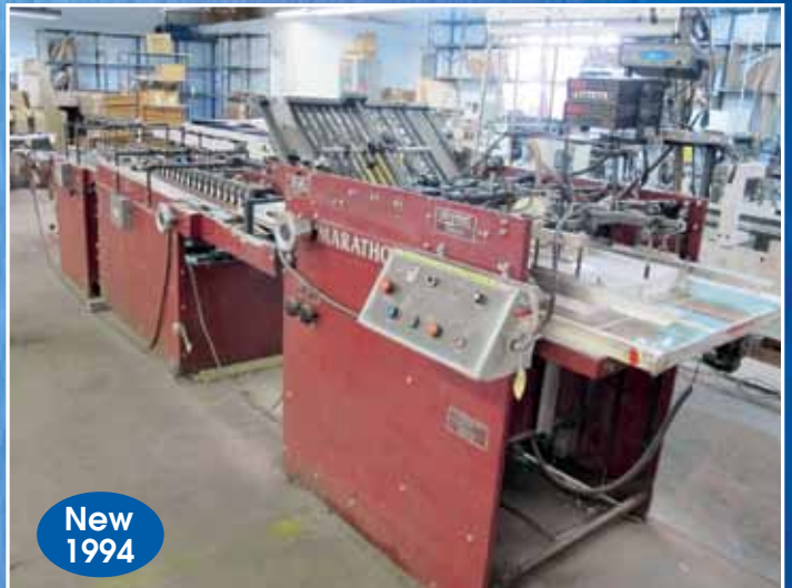
Moll Marathon Pocket Folder and Gluer