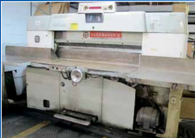
Lawson 48" Paper Cutter Model Pacemaker II

151 Babylon Turnpike, Roosevelt, New York 11575