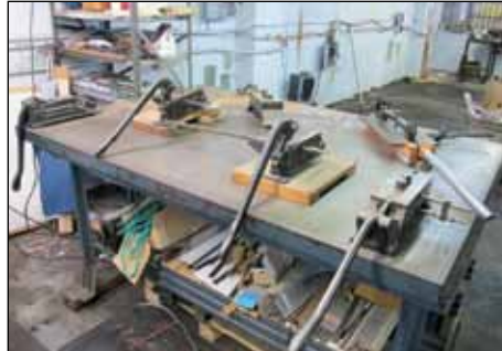
HELMOLD DIE SHEARS AND CRIMPERS