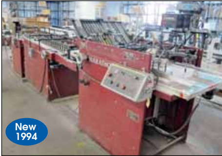
New 1994 MOLL MARATHON POCKET FOLDER AND GLUER