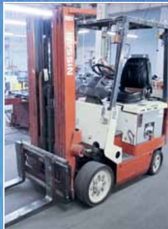
Nissan Electric Forklift

SALE DATE: WEDNESDAY, NOVEMBER 15, 1:00 PM (ET)