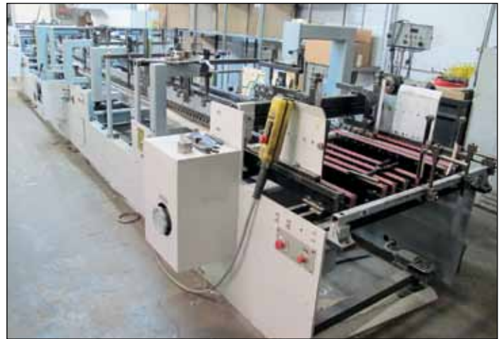
BOBST FOLDER/GLUER MODEL DOMINO 90