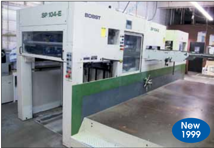
BOBST DIE CUTTER MODEL AUTO PLATEN SP104-E