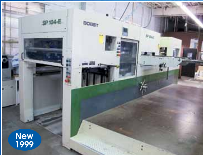
Bobst Die Cutter Model Auto Platen SP104-E

INSPECTION: TUESDAY, NOVEMBER 14, 9 AM TO 4 PM (Local Time)