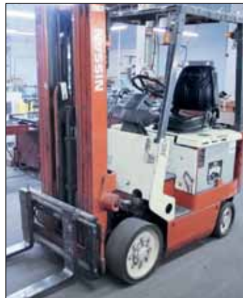
NISSAN ELECTRIC FORKLIFT