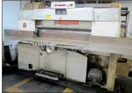
LAWSON 48" PAPER CUTTER MODEL PACEMAKER II