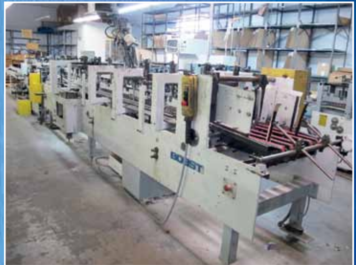
Bobst Folder/Gluer Model Media