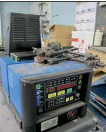
MELTON USA HOT GLUE SYSTEM