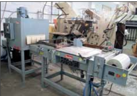
SHANKLIN L-SEAL PACKAGING MACHINE