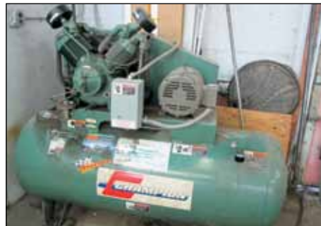
CHAMPION 15 HP HORIZONTAL TANK AIR COMPRESSOR