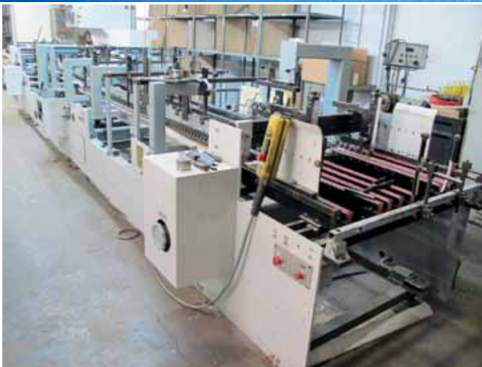
Bobst Folder/Gluer Model Domino 90