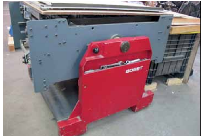
BOBST MAKE READY TABLE