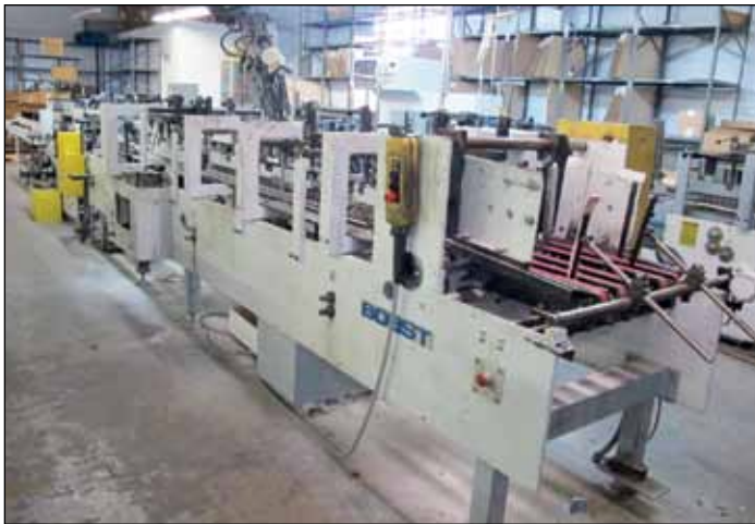
BOBST FOLDER/GLUER MODEL MEDIA