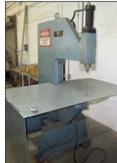
LOCKFORMER ASSEMBLY PRESS