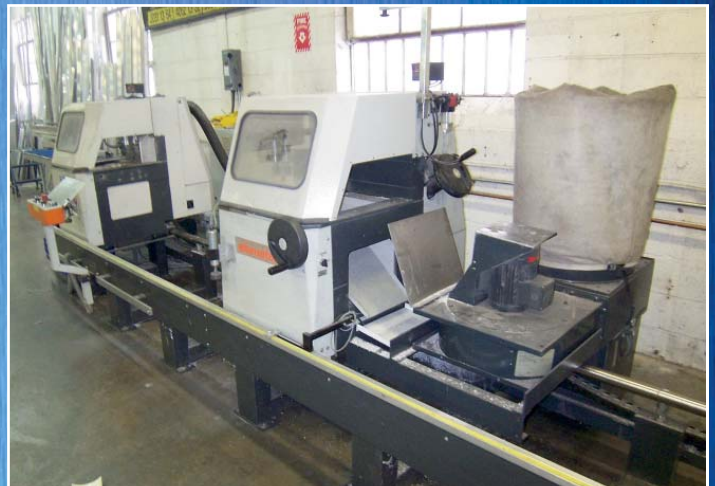
ELUMATEC # DG-142-02 DUAL SAW CUT OFF MACHINE

AUCTION INFORMATION • WWW.THOMASAUCTION.COM • 203-458-0709