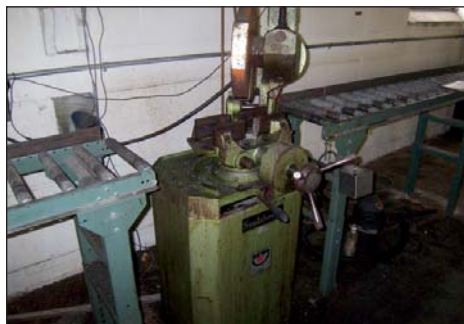
SCOTCHMAN BEWO #350HT/PK CUT OFF SAW