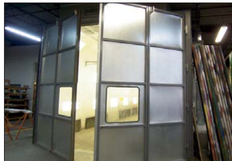
CAROLINA VIRGINIA #16X13X35-SDD/TB SPRAY BOOTH