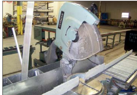
HITACHI 15" MITER SAW #C15FB