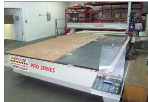
AUTOMATION MULTICAM PRO SERIES ROUTER