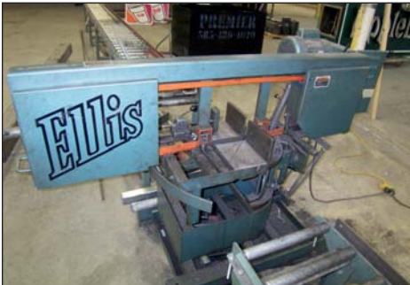
ELLIS #1800 HORIZONTAL BAND SAW