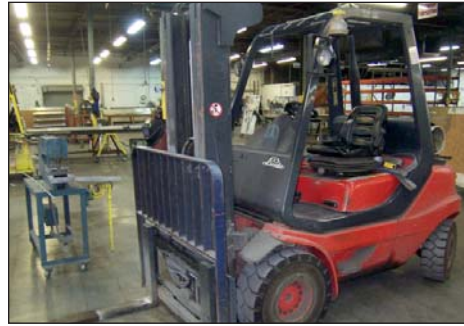
LINDE/BAKER 3,000 LB FORKLIFT MODEL H30T-30