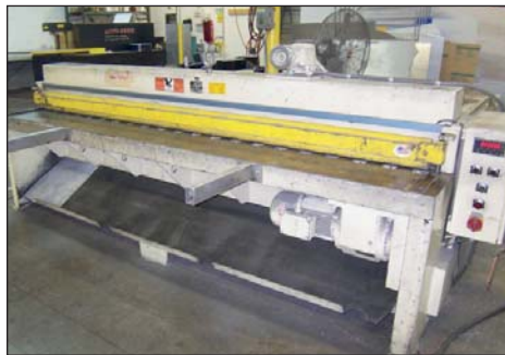
PEXTO 10' SHEAR MODEL 10M14F