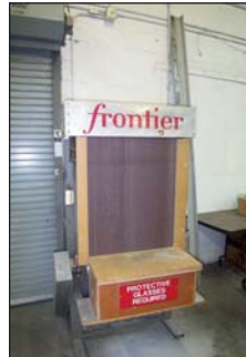
FRONTIER 24" BELT SANDER