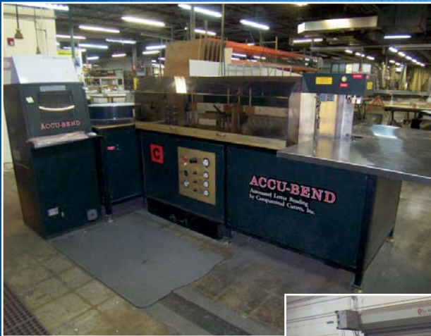
ACCU-BEND AUTOMATED LETTER BENDER

2340 Brighton Henrietta Town Line Rochester, NY 14623