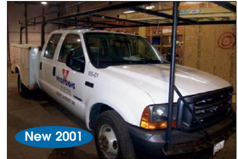
FORD F350XLSD SERVICE TRUCK