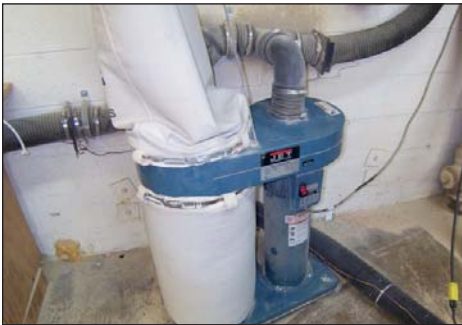
JET DUST COLLECTOR MODEL DC-650