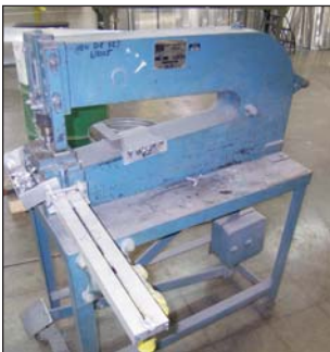
ROPER WHITNEY #68 PUNCH PRESS