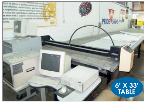
CUTTING EDGE # DCS500 CUTTING TABLE