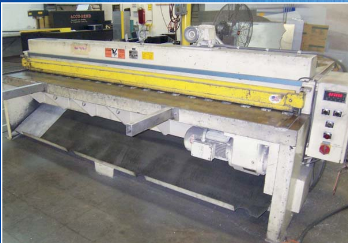
PEXTO 10' SHEAR MODEL 10M14F

COMPLETE PLANT CLOSURE OF SIGN MANUFACTURING PLANT FEATURING: METAL FABRICATING EQUIPMENT, FINISHING EQUIPMENT, LAMINATION EQUIPMENT, GRAPHICS EQUIPMENT AND PLANT SUPPORT