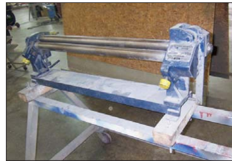
PEXTO # 381D BENDING ROLLS