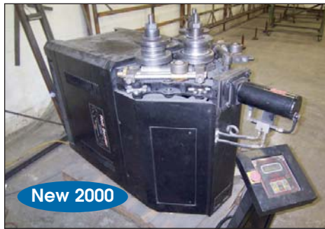
JANCY/ERCOLINA #CE50 ROLL BENDER