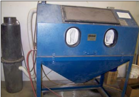
CYCLONE BLAST CABINET