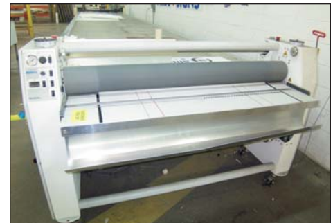
SEAL GRAPHICS IMAGE 600-S LAMINATOR