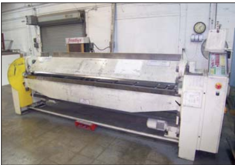
ROPER WHITNEY 10' AUTO BRAKE 2000 #AB1014K