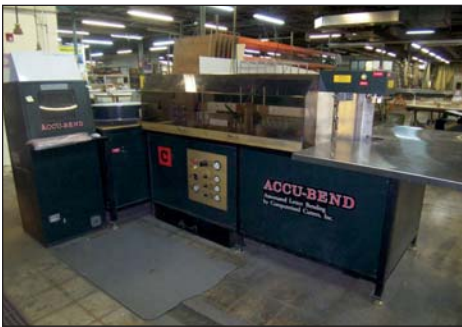
ACCU-BEND AUTOMATED LETTER BENDER