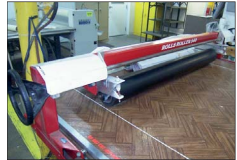
GSP ROLLS ROLLER 540 CUTTING TABLE