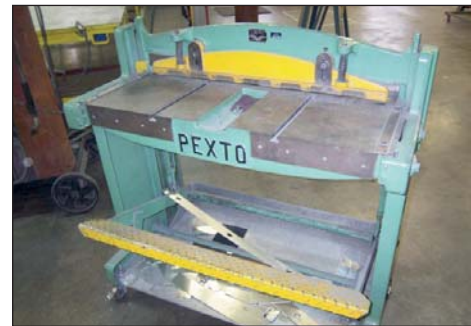
PEXTO SHEAR MODEL 137-L