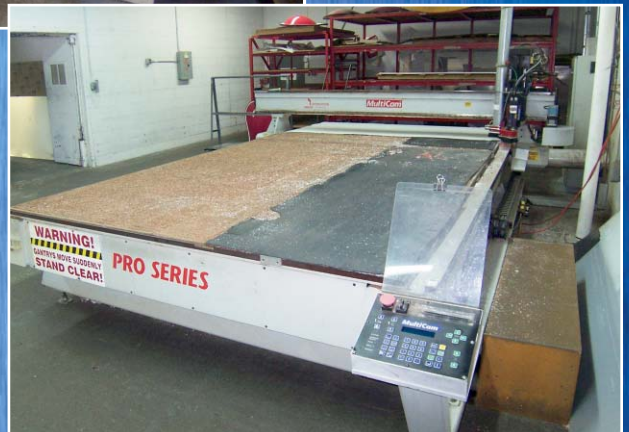
AUTOMATION MULTICAM PRO SERIES ROUTER

Sale Date: Wednesday, March 17, 10:30 AM (ET)