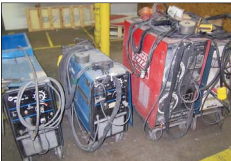
PARTIAL VIEW OF WELDERS