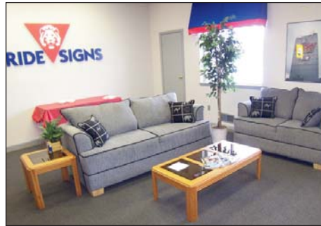
VIEW OF RECEPTION AREA