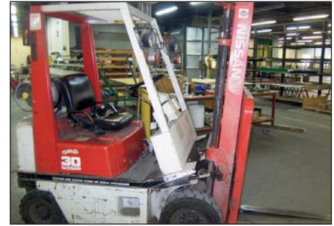
NISSAN 3,000 LB LPG FORKLIFT MODEL NOMAD 30