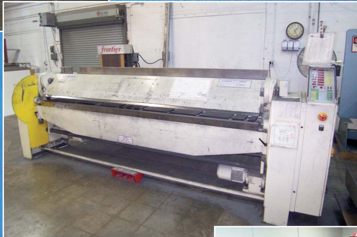
ROPER WHITNEY 10' AUTO BRAKE 2000 #AB1014K