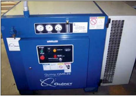
QUINCY 25 HP #QMB-25 AIR COMPRESSOR