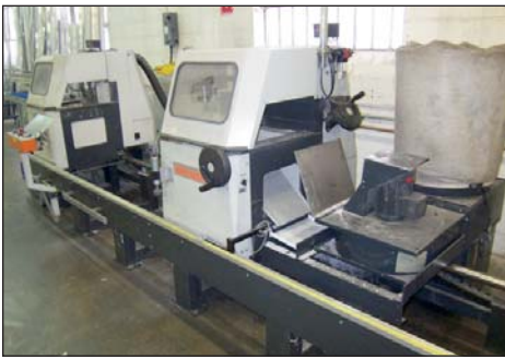
ELUMATEC # DG-142-02 DUAL SAW CUT OFF MACHINE