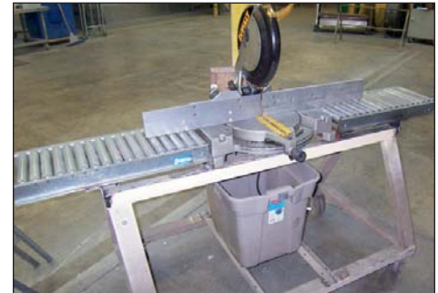
DEWALT 12" COMPOUND MITER SAW #DW705