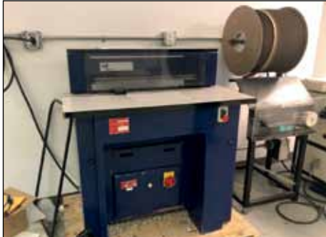
JAMES BURN MOD EP700 MULTI HOLE PUNCH (MARKHAM)