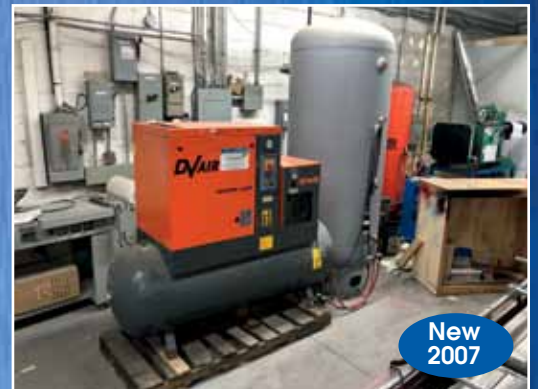
Devair Rotary Screw Air Compressor 15 HP (Markham)