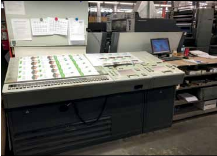
HEIDELBERG CD102-6-L, CONTROL CONSOLE (MARKHAM)