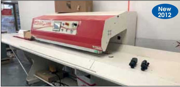
FLEXA SIGN MAKER APOLLO 155 IMPULSE WELDER (MARKHAM)