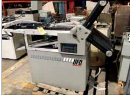
MORGANA BINDER UFO-1 PAPER FOLDER (MISSISSAUGA)