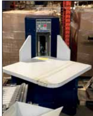
VACUUMATIC PAPER COUNTER (MISSISSAUGA)