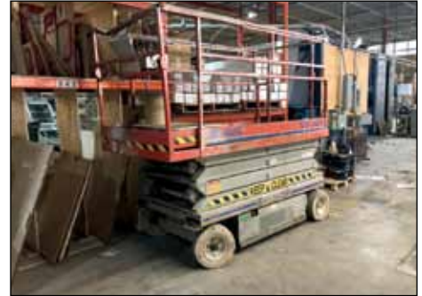
SKYJACK PLATFORM SCISSOR LIFT 4626 (MISSISSAUGA)