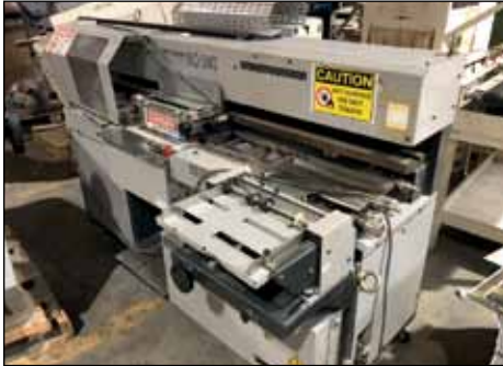
HORIZON BQ-240 PERFECT BINDER (MISSISSAUGA)