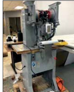
HIKER RIVET FASTENER HM308HMS (MARKHAM)