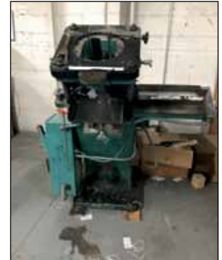
PMC MOD F.82 DIE CUTTER (MARKHAM)