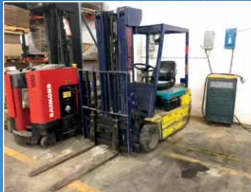
Raymond - Komatsu Forklifts (Mississauga)

Inspection Date: Tuesday, November 27, 9 AM to 4 PM (LOCAL TIME)