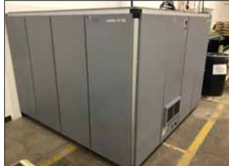
DURST LAMBDA 131HS LARGE FORMAT DIGITAL LASER IMAGER (MISSISSAUGA)