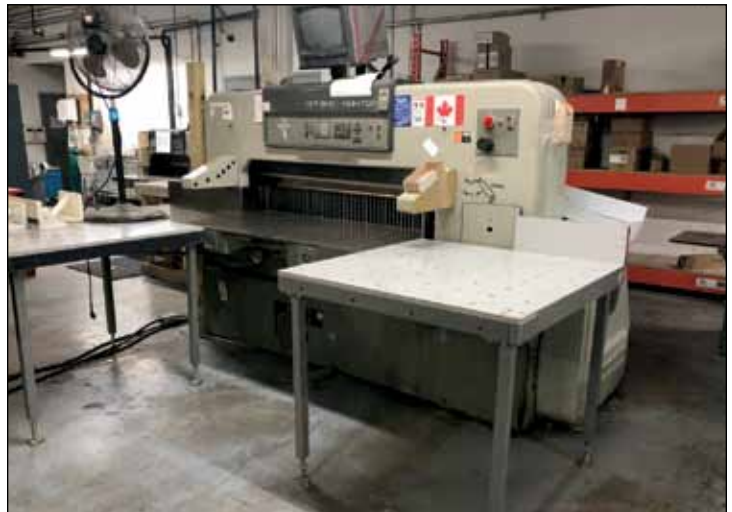
POLAR MOHR CUTTER 137-EMC-MON (MARKHAM)