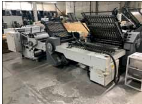
HEIDELBERG STAHL FOLDER 1426E-C-3 4/4/4 (MARKHAM)