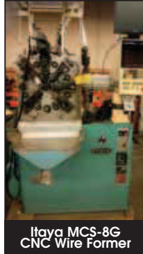
Itaya MCS-8G CNC Wire Former