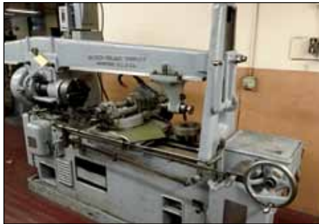
BARBER COLMAN #12 TYPE A GEAR HOBGING MACHINE

SALE DATE: THURS, SEPTEMBER 13, 1:00 PM (ET)