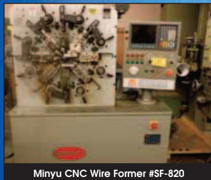
Minyu CNC Wire Former #SF-820