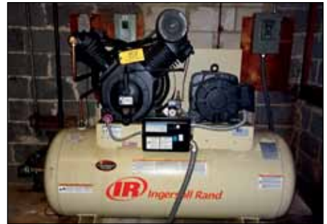
INGERSOLL RAND 15 HP HORIZONTAL TANK AIR COMPRESSOR