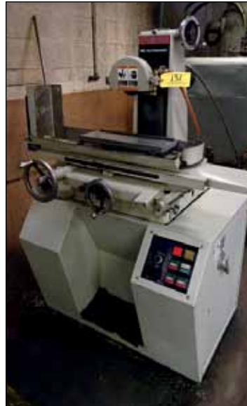
HARIG MODEL 618 AUTOMATIC SURFACE GRINDER