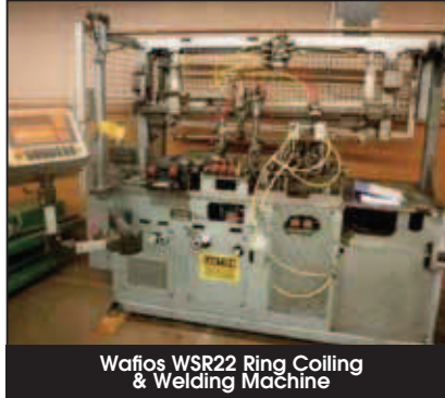
Wafios WSR22 Ring Coiling & Welding Machine

Itaya MCS-8G CNC Wire Former (1996), S/N 8270, MCS Systems V Control, .8 mm Capacity, Rotary Quill, Coilmaster, Powered Payoff Reel