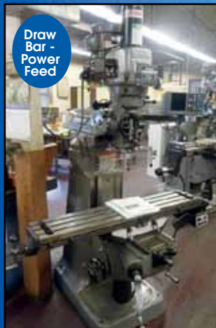
Bridgeport 2 HP Vertical Mill, Accurite DRO