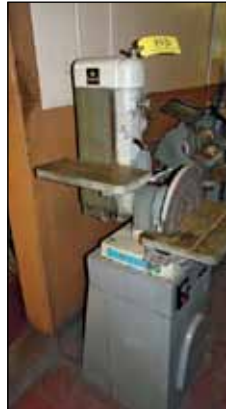
ROCKWELL 6" BELT / 12" DISC SANDER