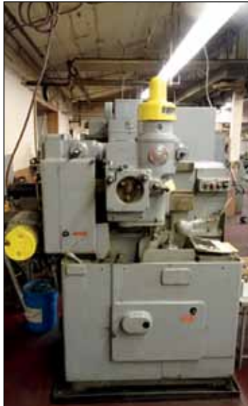
FELLOWS TYPE 8-AGS GEAR SHAPER