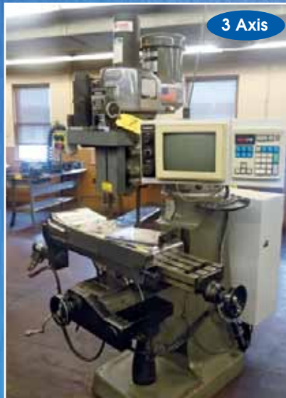
Bridgeport 2 HP EZ-Trak CNC Vertical Mill

INSPECTION DATE: Tuesday, September 12, 9 AM TO 4 PM (LOCAL TIME)