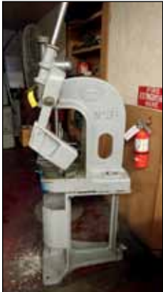
GREENERD #3-1/2 ARBOR PRESS