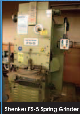
Shenker FS-5 Spring Grinder