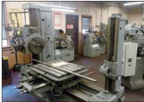
PLAURET HORIZONTAL BORING MILL TOS TYPE 863