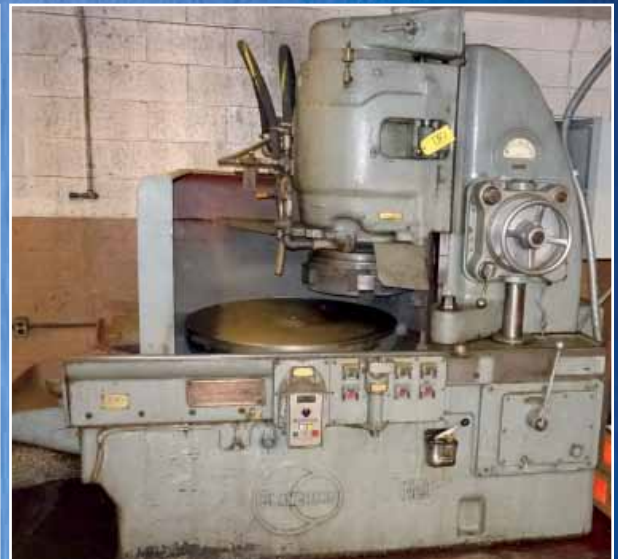
Blanchard #18 36" Rotary Surface Grinder