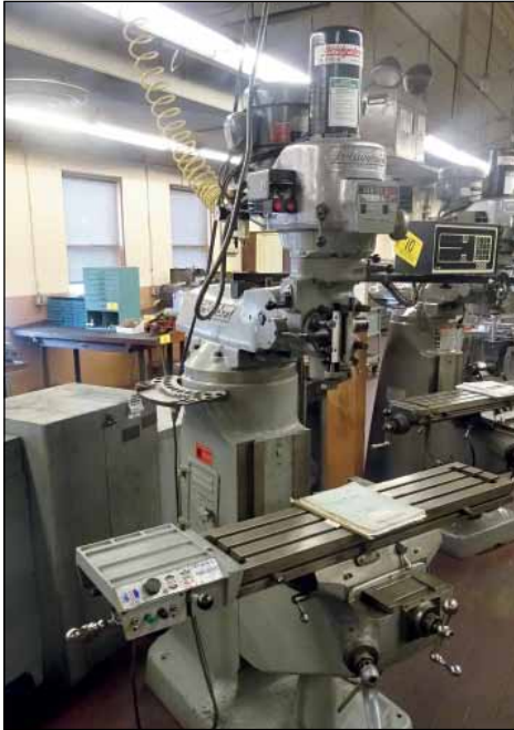
BRIDGEPORT 2 HP EZ-TRAK CNC VERT MILLING MACHINE