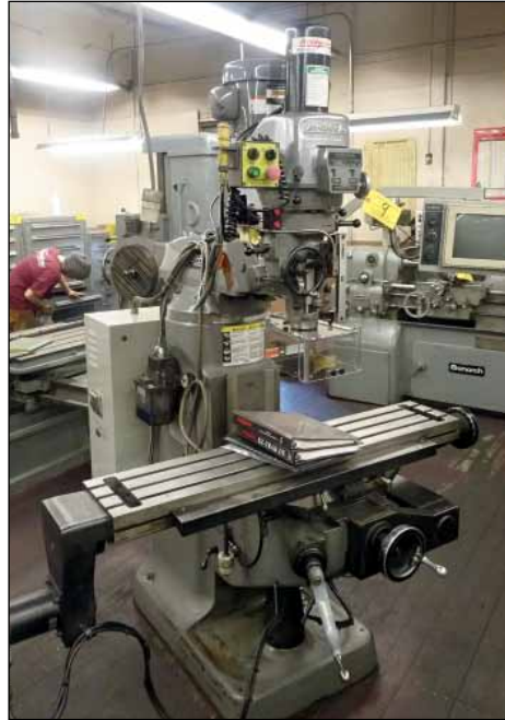
BRIDGEPORT 2 HP EZ-TRAK CNC VERT MILLING MACHINE