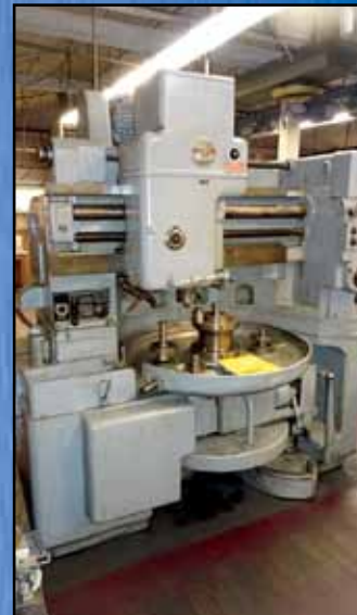
Fellows Type 36-6 Gear Shaper