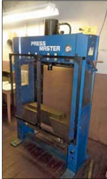
PRESSMASTER 50-TON 4-POST HYDRAULIC PRESS MODEL 5TE/H