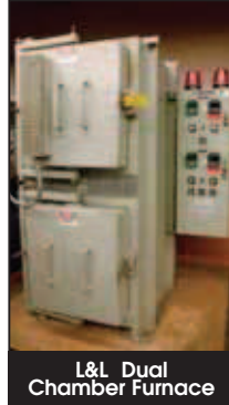
L&L Dual Chamber Furnace