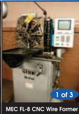
MEC FL-8 CNC Wire Former