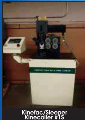
Kinefac/Sleeper Kinecoiler #1S