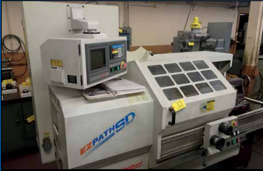
Romi-Bridgeport EZ-Path SD CNC Lathe

OPEN HOUSE INSPECTION: WEDNESDAY, SEPTEMBER 12, 9 AM TO 4 PM (LOCAL TIME)