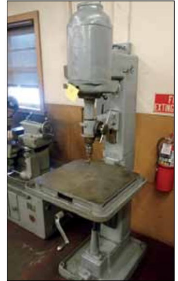
LELAND GIFFORD PEDESTAL DRILL PRESS