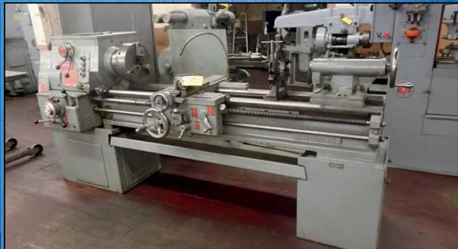
Southbend 17" Turn-nado Gear Head Lathe Type CL170E