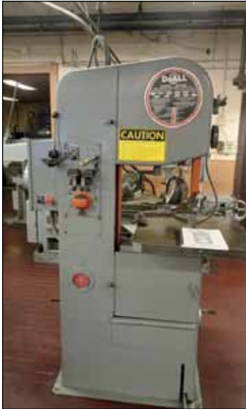
DOALL VERTICAL BAND SAW MODEL 612-0