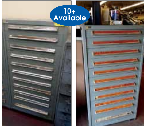
VIDMAR CABINETS AND CONTENTS