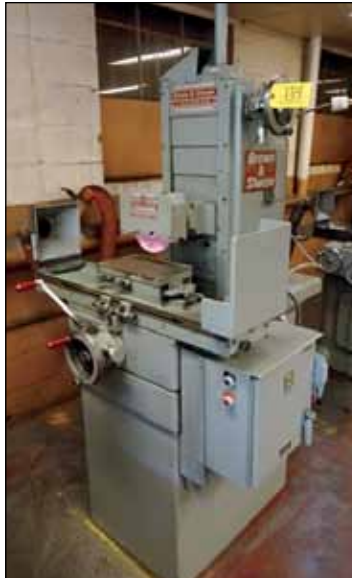
BROWN & SHARPE MODEL 612 SURFACE GRINDER