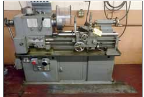
TS HARRISON LATHE, 32" BED