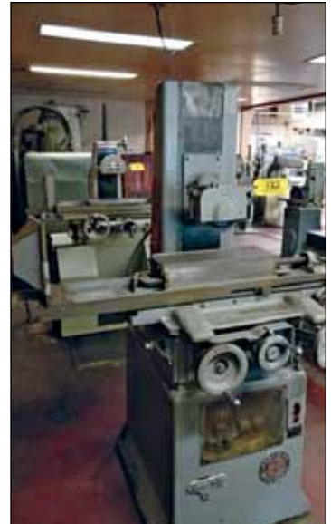
REID MODEL 618V SURFACE