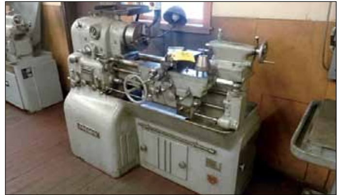
MONARCH EE TOOLROOM, 12.5" X 20",