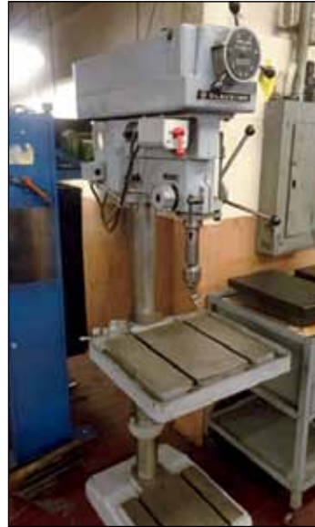
CLAUSING VARIABLE SPEED PEDESTAL DRILL PRESS # 2276