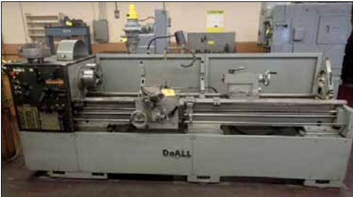
DOALL 16 LATHE