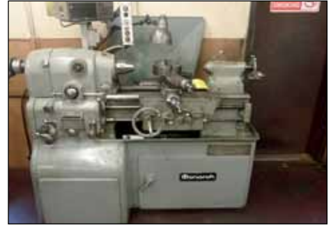
MONARCH TOOLROOM LATHE, 10" X 20"