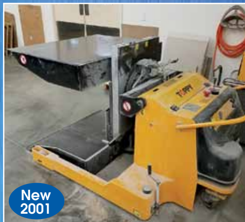
Topyy Pile Turner