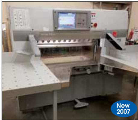
POLAR 45" CUTTER MODEL 115 XT