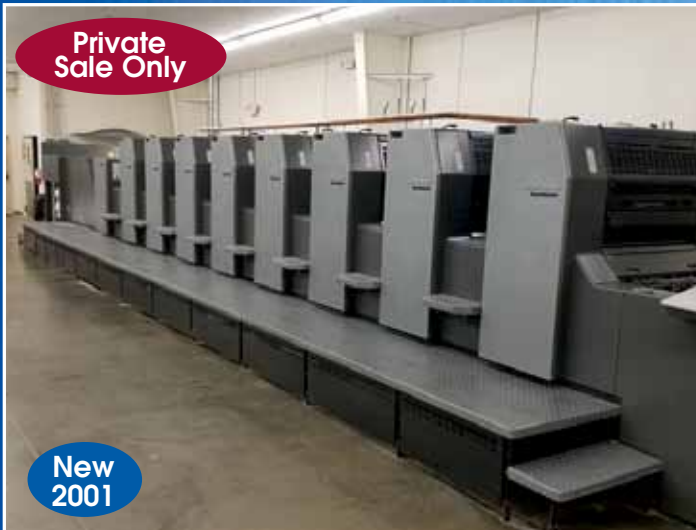
Heidelberg 8-Color Sheet Fed Printing Press # SM 74-8-P5+L

INSPECTION: TUESDAY, APRIL 24 9 AM TO 4 PM (Local Time)