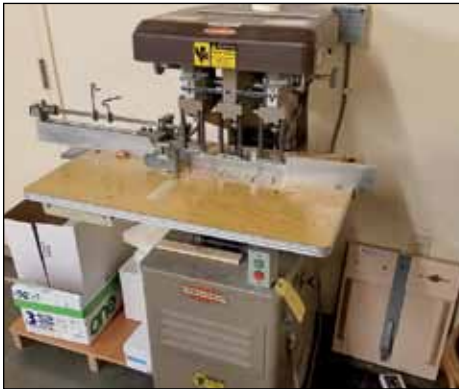
CHALLENGE 3-SPINDLE DRILL