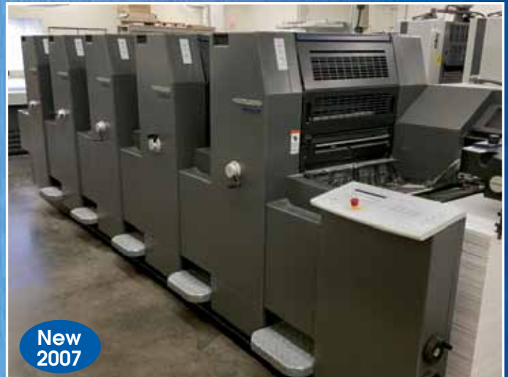
Heidelberg 5-Color Sheet Fed Printing Press, Model PM 52-5