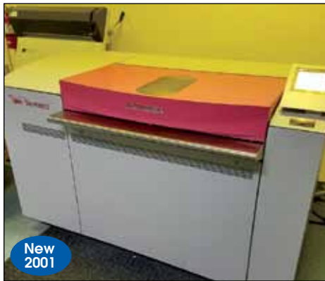
SCREEN CTP MACHINE MODEL PLATE RITE 4000 II