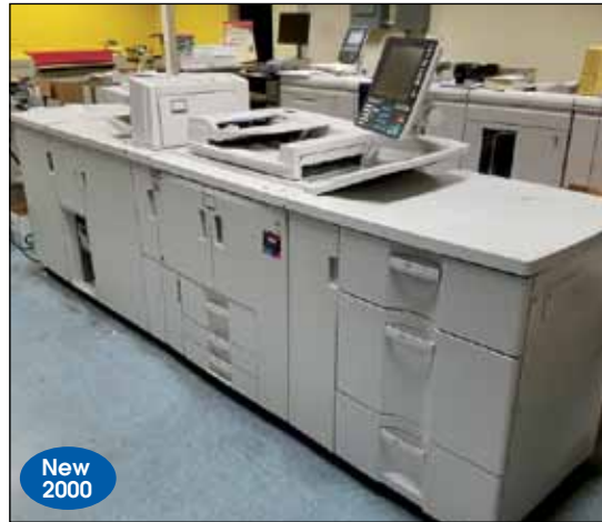
RICOH DIGITAL PRESS MODEL PRO 906 EX