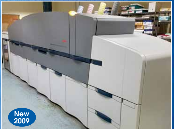
Kodak Digital Printing Press Model Nexpress 2500