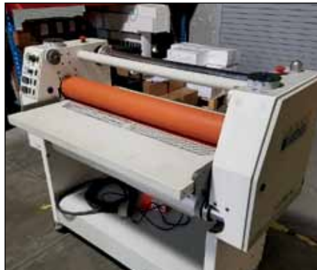
SEAL LAMINATOR MODEL IT-400