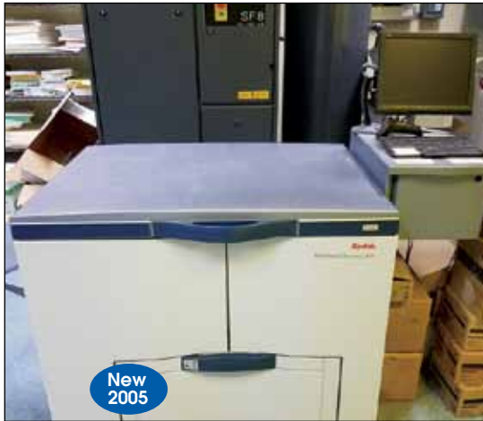
KODAK NEXPRESS GLOSSING UNIT MODEL SAP 576694