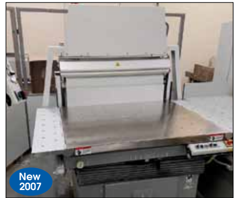
POLAR JOGGER MODEL RA 4