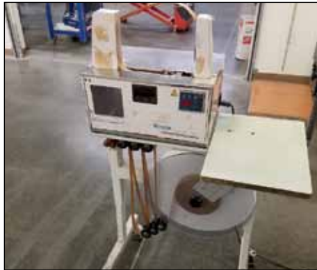
WEXLER BANDING MACHINE MODEL ATS-CE-240/30