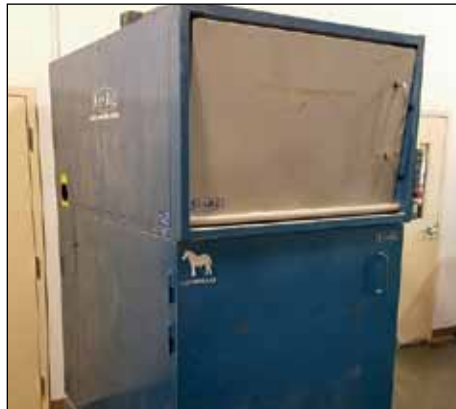
KEN BAY WASTE COMPACTOR