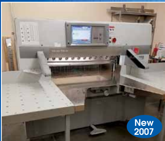
Polar 45" Cutter Model 115 XT

1808 Concept Court, Daytona Beach, Florida 32114