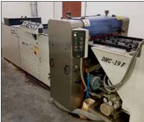
DORN UV COATER MODEL DMC-19F