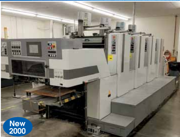
Sakurai 4-Color Sheet Fed Printing Press Model 474-EP II