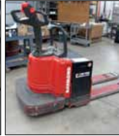
RAYMOND 3000 LB. ELECTRIC PALLET JACK