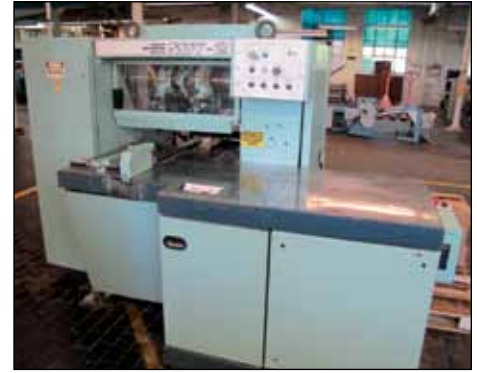
ORIGINAL PERFECTA POLYGRAPH 3-KNIFE TRIMMER MODEL SDY-2