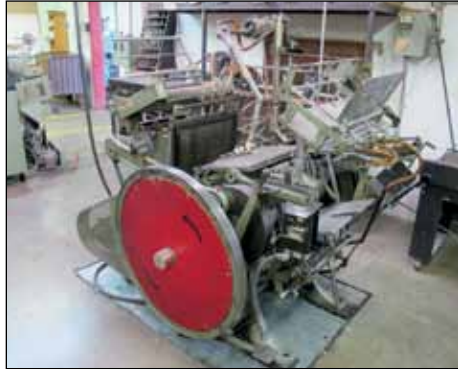
KLUGE DIE CUTTER