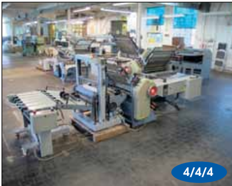
HEIDELBERG FOLDER MODEL 1426C