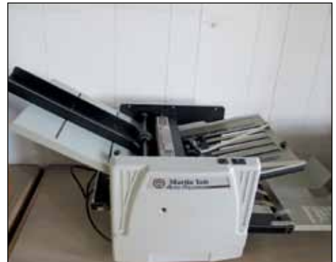
MARTIN YALE AUTO FOLDER