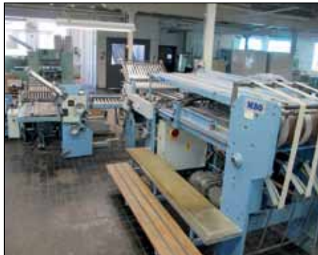
MBO FOLDER MODEL T66