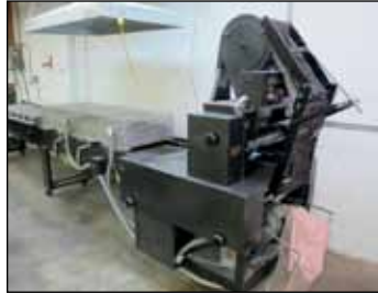
VIRKOTYPE THERMOGRAPHY UNIT MODEL F15E