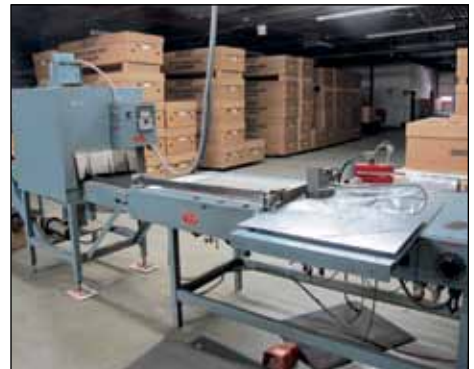
SHANKLIN L-SEAL PACKAGING MACHINE MODEL 6-4C