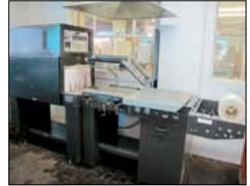
ESTEY L-SEAL PACKAGING MACHINE W/HEAT TUNNEL