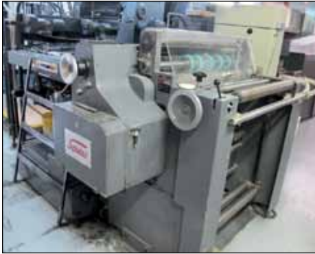
SPIESS RIGHT ANGLE ROLL SHEETER MODEL HSQ-102