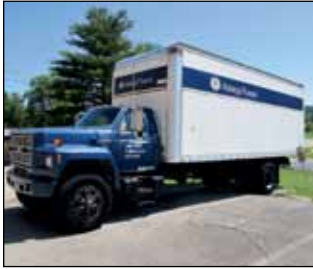
1994 FORD F800 BOX TRUCK