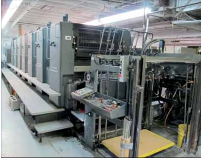
HEIDELBERG 6-COLOR SHEET FED PRINTING PRESS MODEL 102SP+L