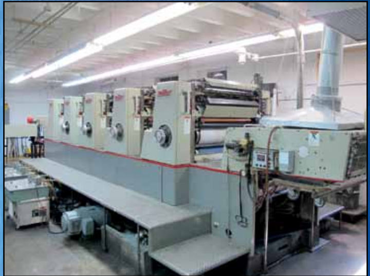
Miller 5-Color Sheet Fed Printing Press Model TP-38A