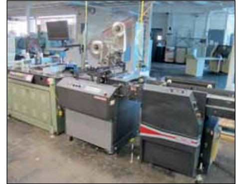
VARIABLE DATA PRINT SYSTEM W/ XI JET INKJET PRINTER AND SECAP JET 1 TABBER