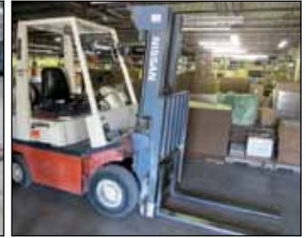
NISSAN LPG FORKLIFT MODEL 30