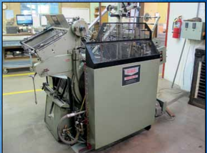
Kluge Die Cutter / Foil Stamper Model EHD 14 x 22