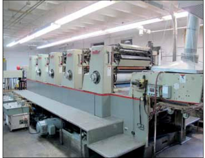
MILLER 5-COLOR SHEET FED PRINTING PRESS MODEL TP-38A