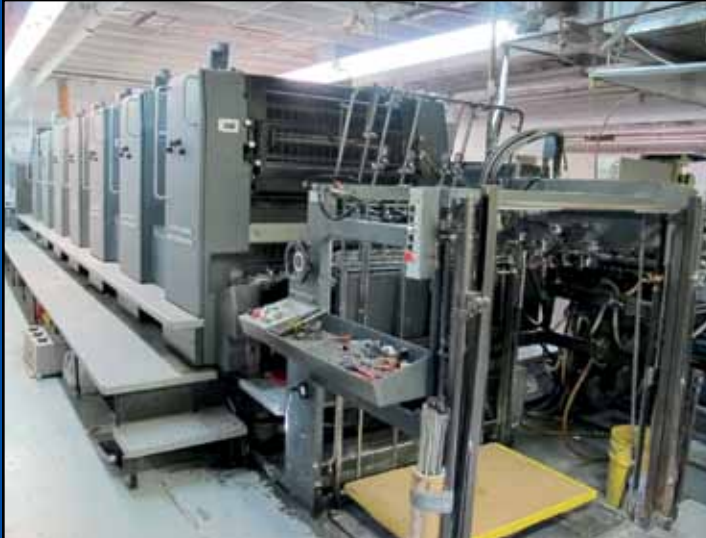
Heidelberg 6-Color Sheet Fed Printing Press Model 102SP+L

OPEN HOUSE INSPECTION: TUESDAY, JUNE 27, 9 AM TO 4 PM (LOCAL TIME)