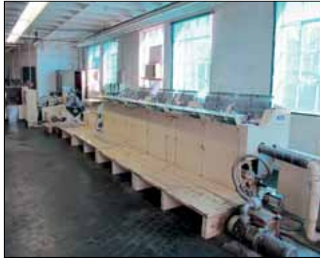
MCCAIN 2000 SADDLE STITCHER LINE