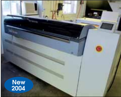
SCREEN PLATERITE 8100 CTP SYSTEM MODEL PTR8100