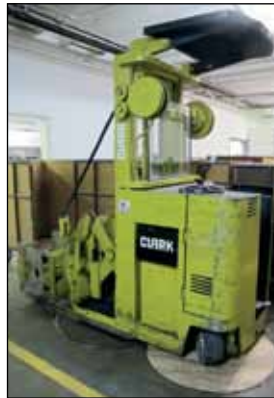
CLARK NARROW AISLE LIFT TRUCK W/ROLL CLAMP MODEL NP500-35