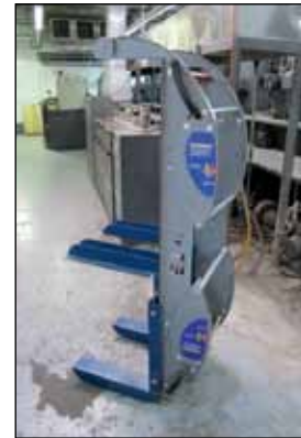
E-Z 41 PILE TURNER