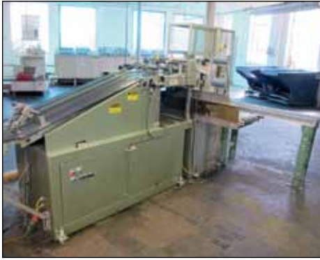
KIRK RUDY DELIVERY/STACKER MODEL 703