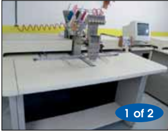
ULTRAMATIC EMBROIDERY MACHINES 1 OF 2