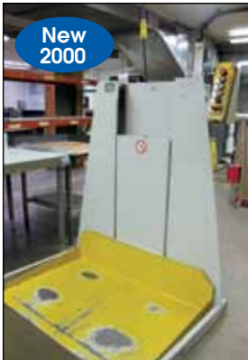
NEW 2000 POLAR MOHR PAPER LIFT MODEL LW1000-4