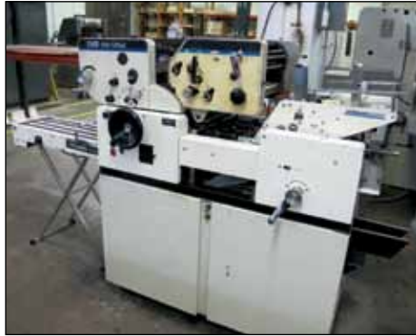
MULTI OFFSET DUPLICATOR MODEL 1360, 2-COLOR