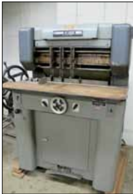
LAWSON HIGH SPEED PAPER DRILL MODEL HEAVY DUTY