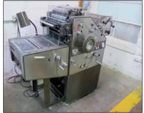
AB DICK OFFSET DUPLICATOR MODEL 9850, 2-COLOR