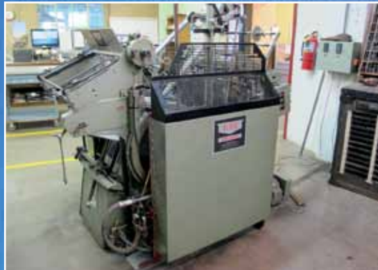
Kluge Die Cutter / Foil Stamper Model EHD 14 x 22

INSPECTION DATE: TUESDAY, JUNE 27, 9 AM TO 4 PM (LOCAL TIME)