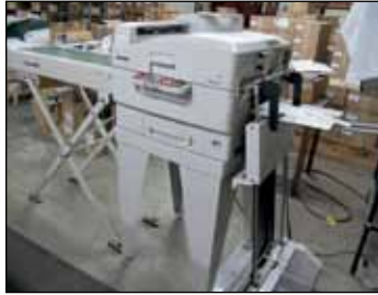
XANTE ENVELOPE PRINTER