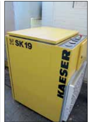
KAESER ROTARY SCREW AIR COMPRESSOR MODEL SK19