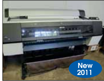
EPSON STYLUS PRO 9890 PROOFER