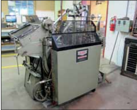
KLUGE DIE CUTTER / FOIL STAMPER MODEL EHD 14 X 22