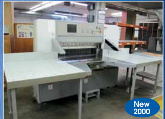
Polar Mohr Paper Cutter Model 115ED