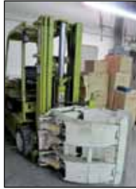
CLARK 5000 LB FORKLIFT W/ROLL CLAMP