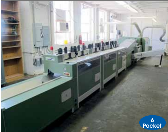
MULLER MARTINI PANDA II PERFECT BINDER MODEL 1530